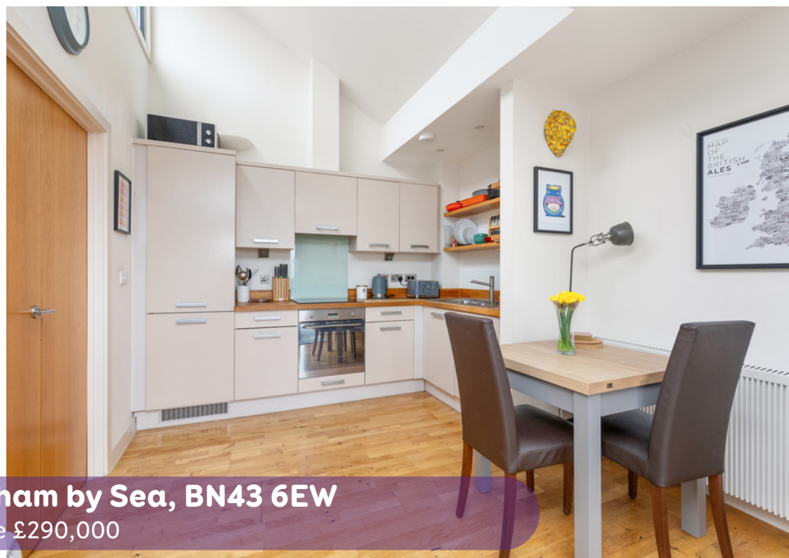
Mercury House, Shoreham by Sea, BN43 6EW Guide Price £290,000