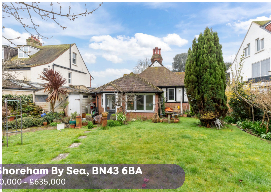
Upper Shoreham Road, Shoreham By Sea, BN43 6BA Guide Price £600,000 - £635,000