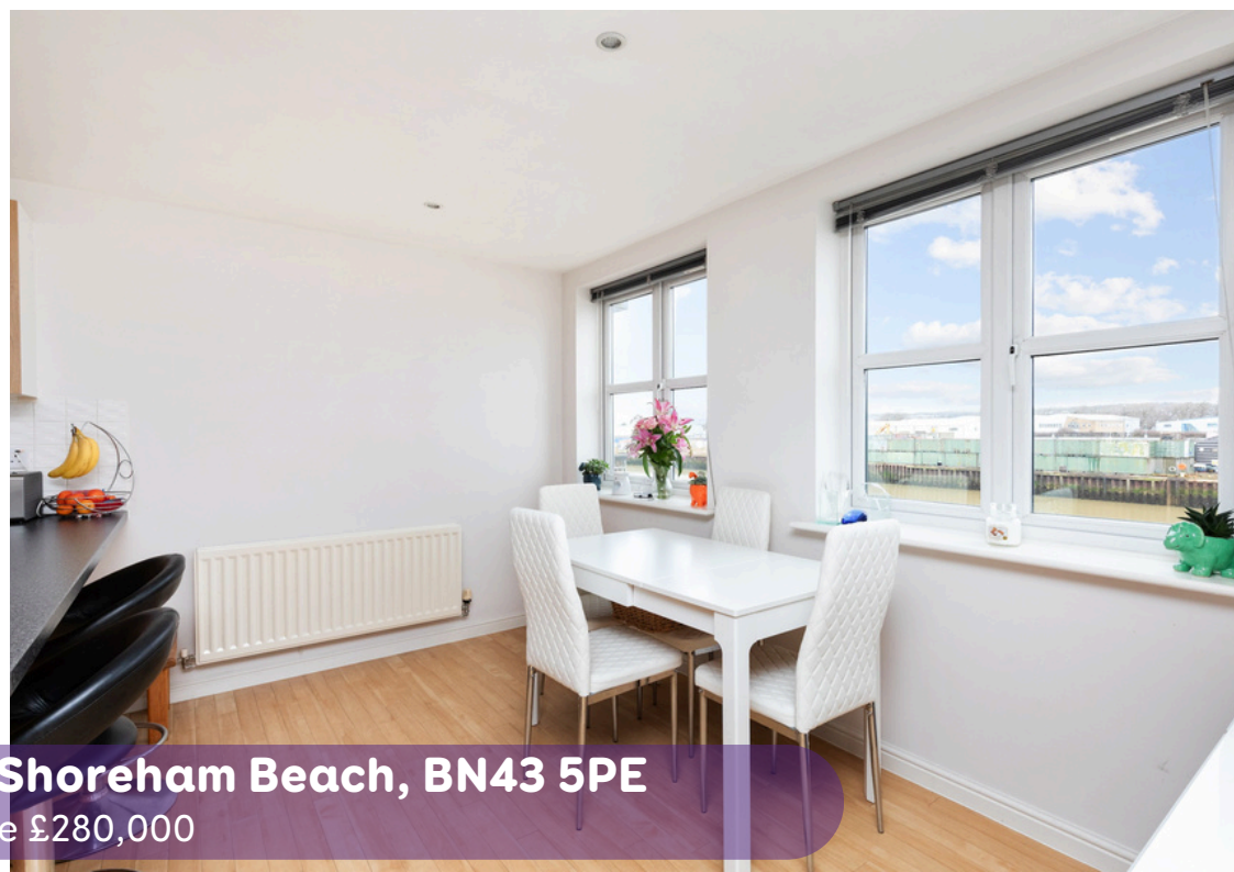
Dunwich, Sussex Wharf, Shoreham Beach, BN43 5PE Asking Price £280,000