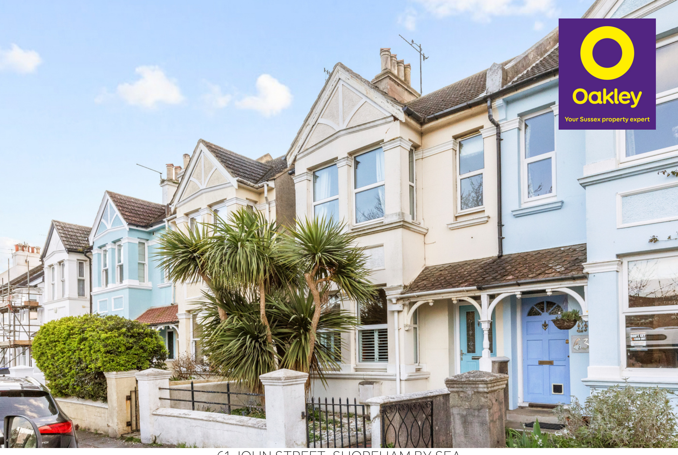
61 JOHN STREET, SHOREHAM BY SEA