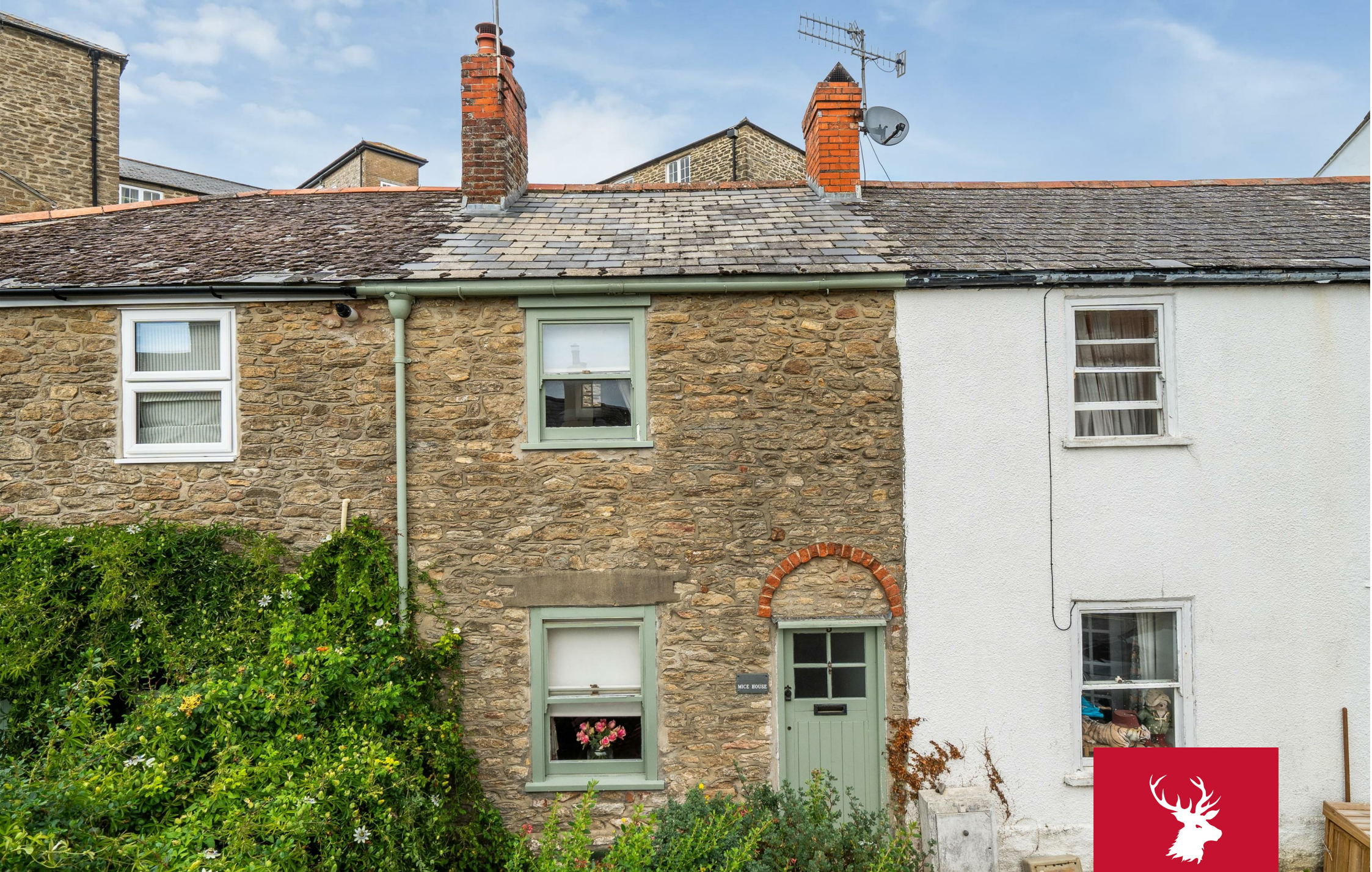
Five Mice House