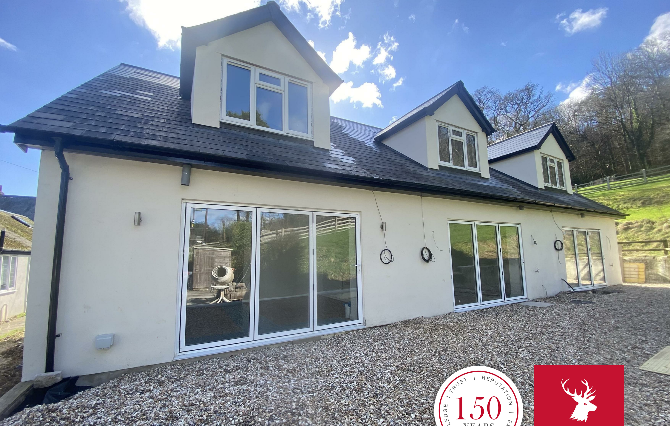
Grangebegg, Harcombe House