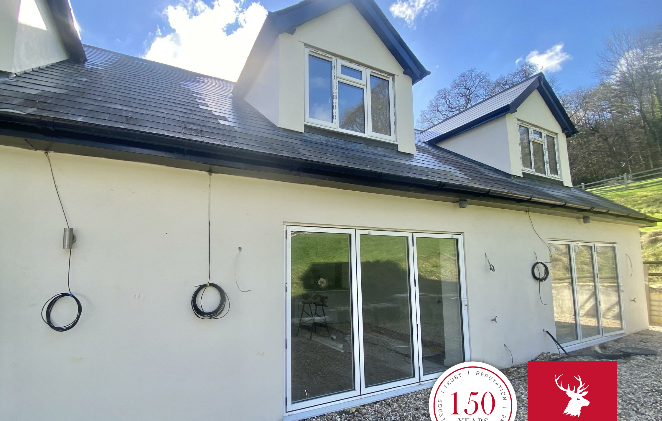
Wooly, Harcombe House