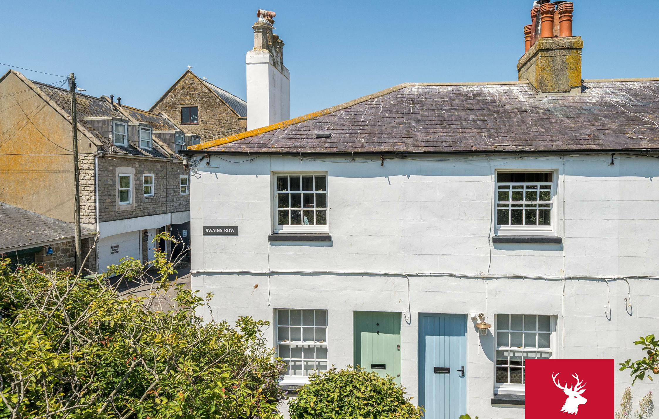
1 Swains Row