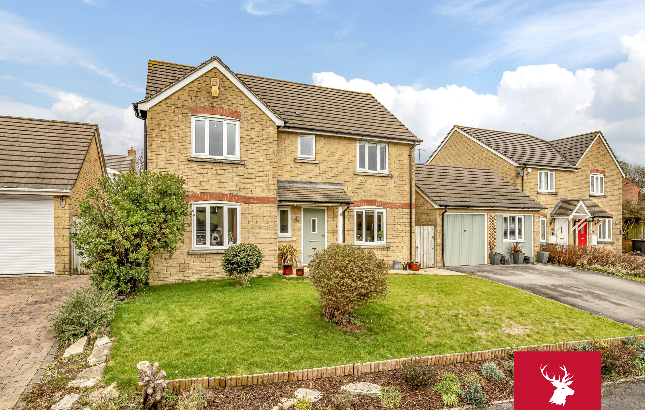
2 Horn Hill View