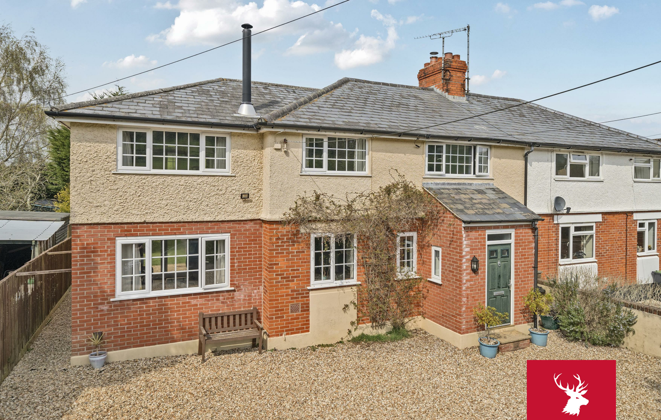
3 Hill View