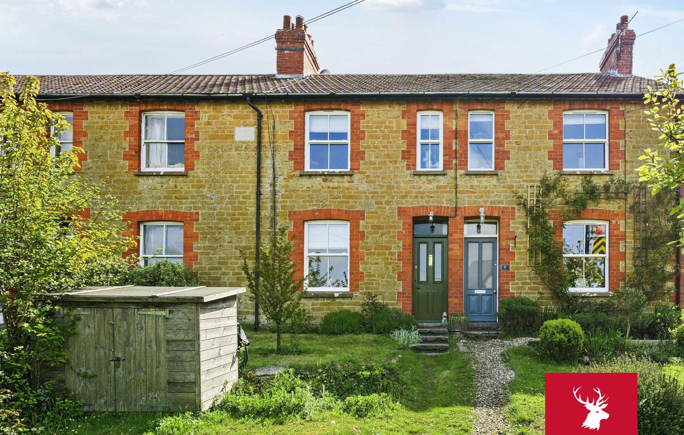
3, Gore Terrace