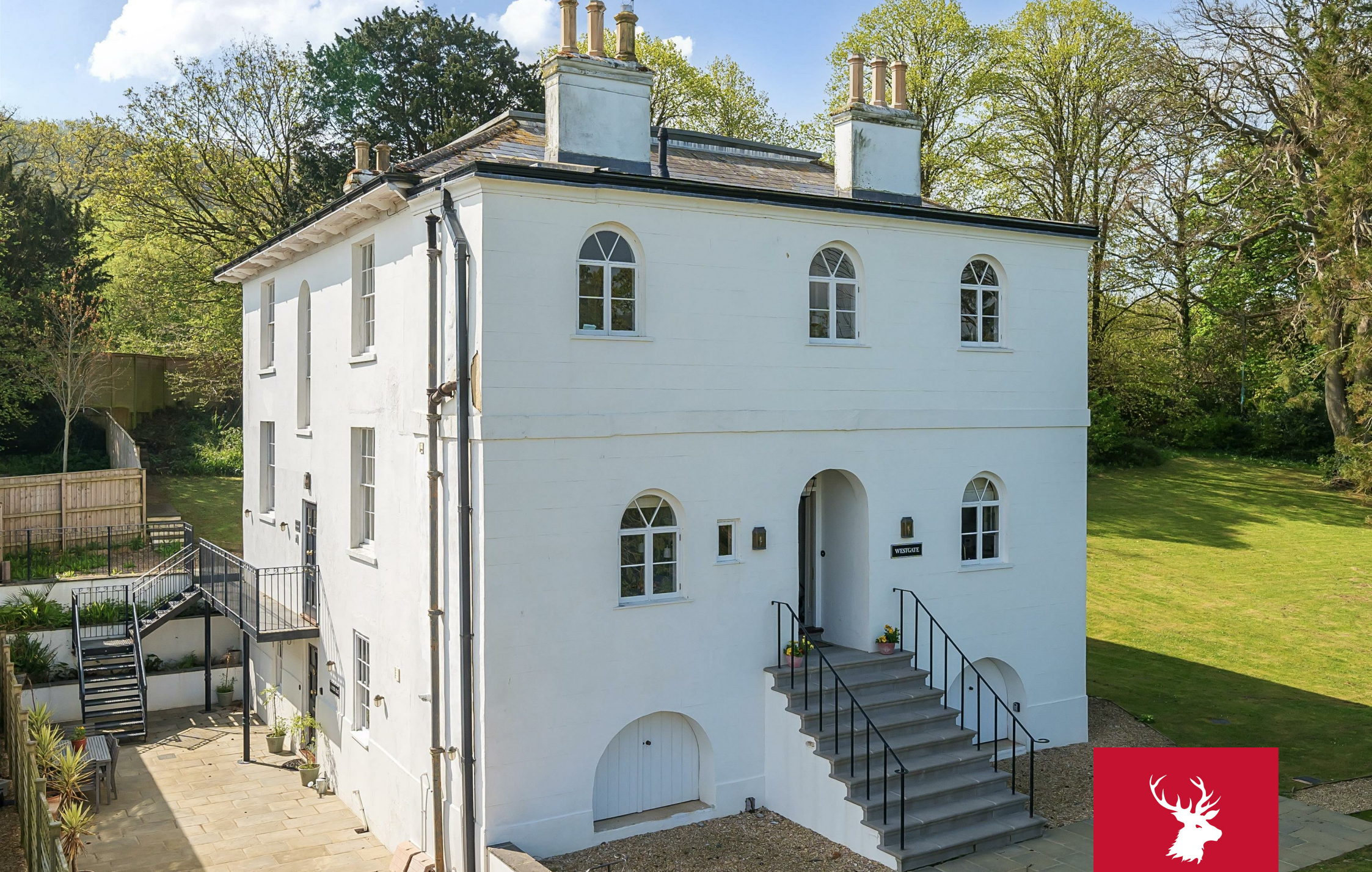
Flat 3, Bellair House