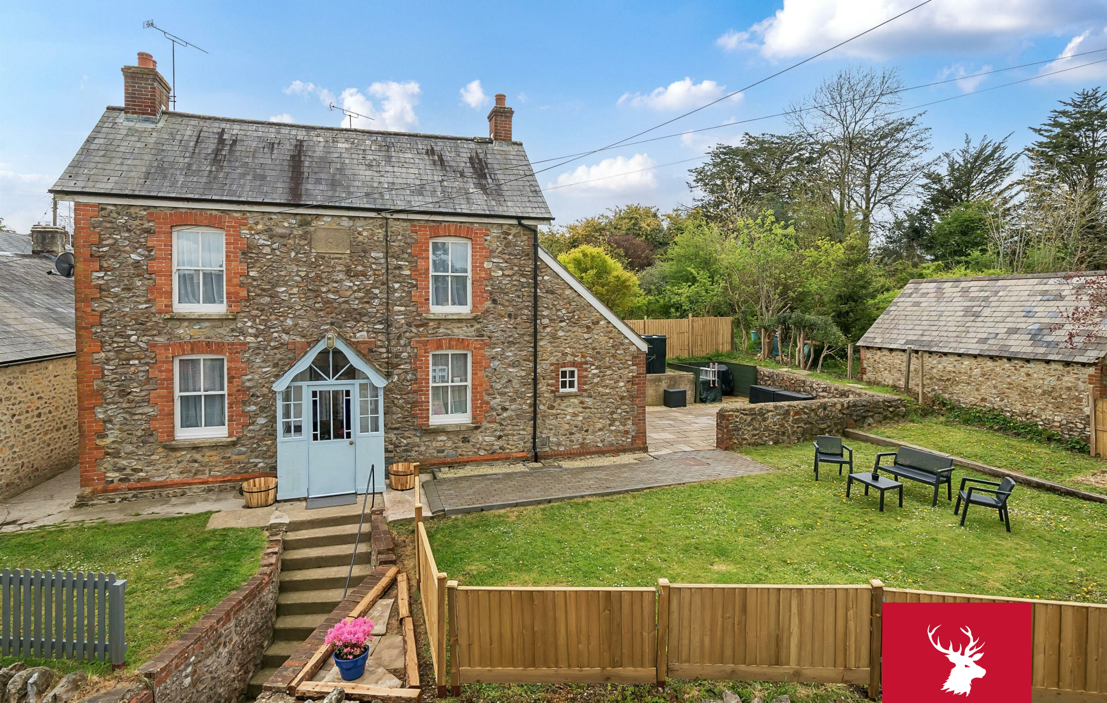
Diamond Jubilee Cottage