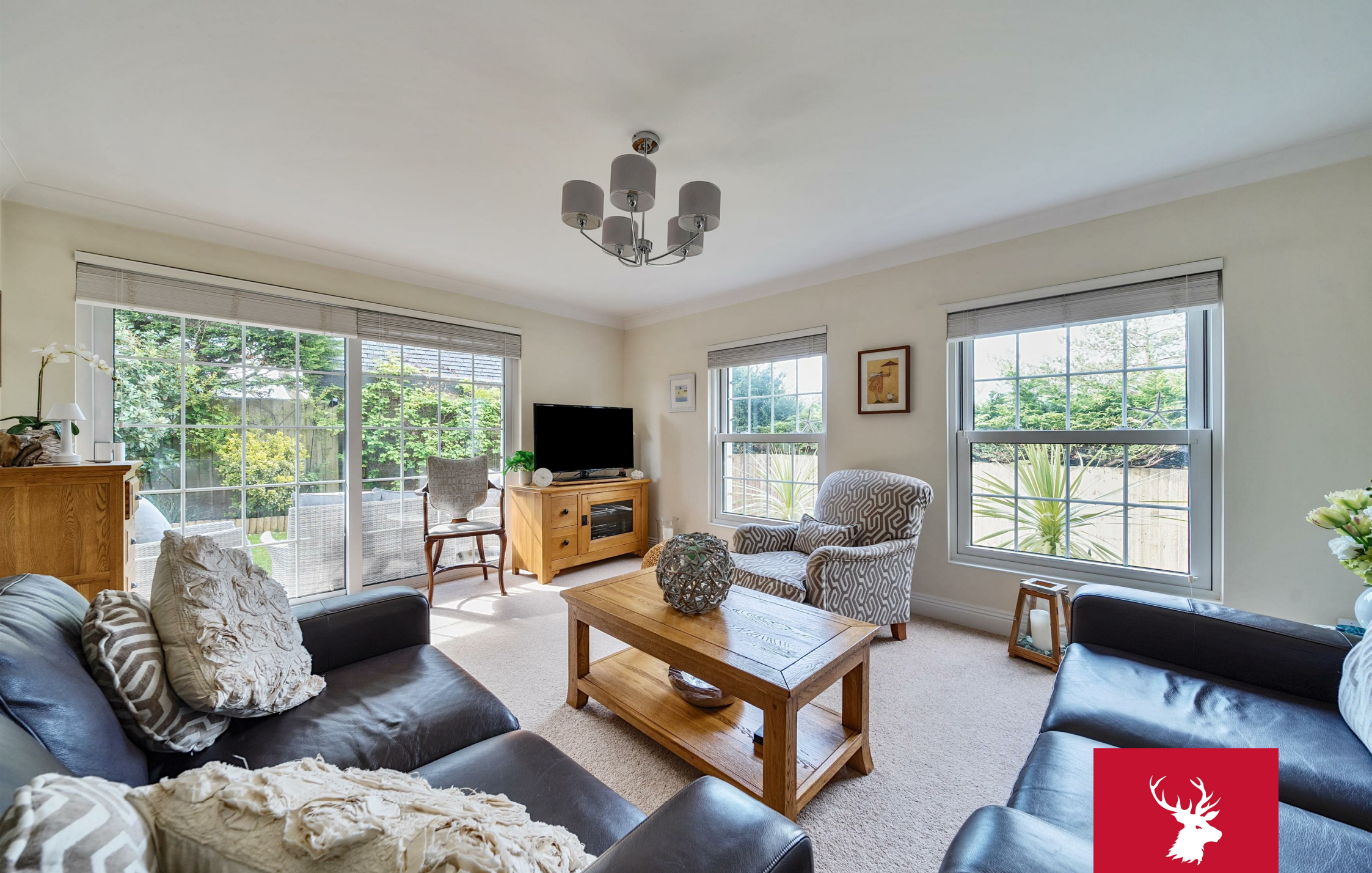
1 Summerhill House