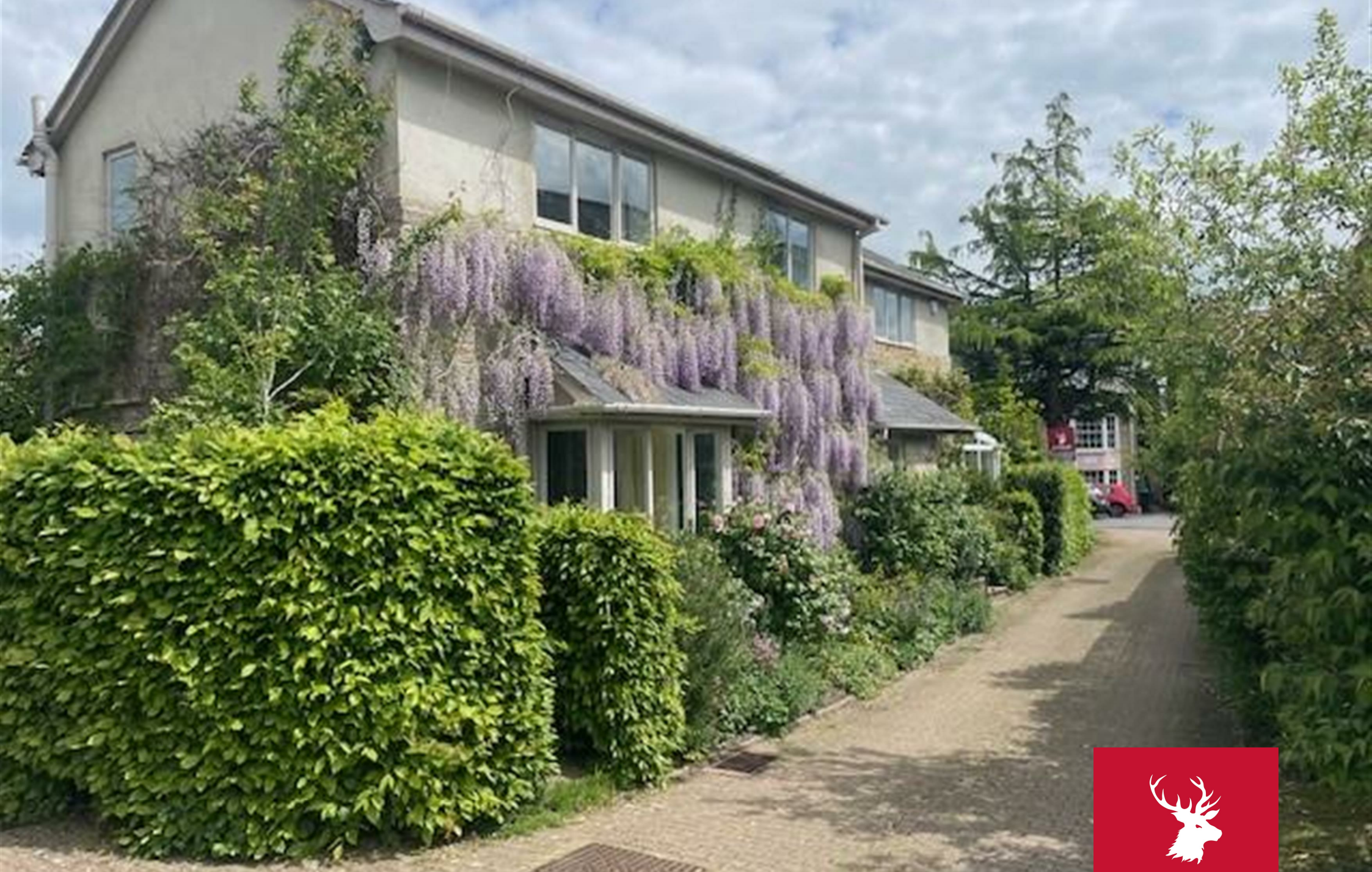
2 Pines Mews