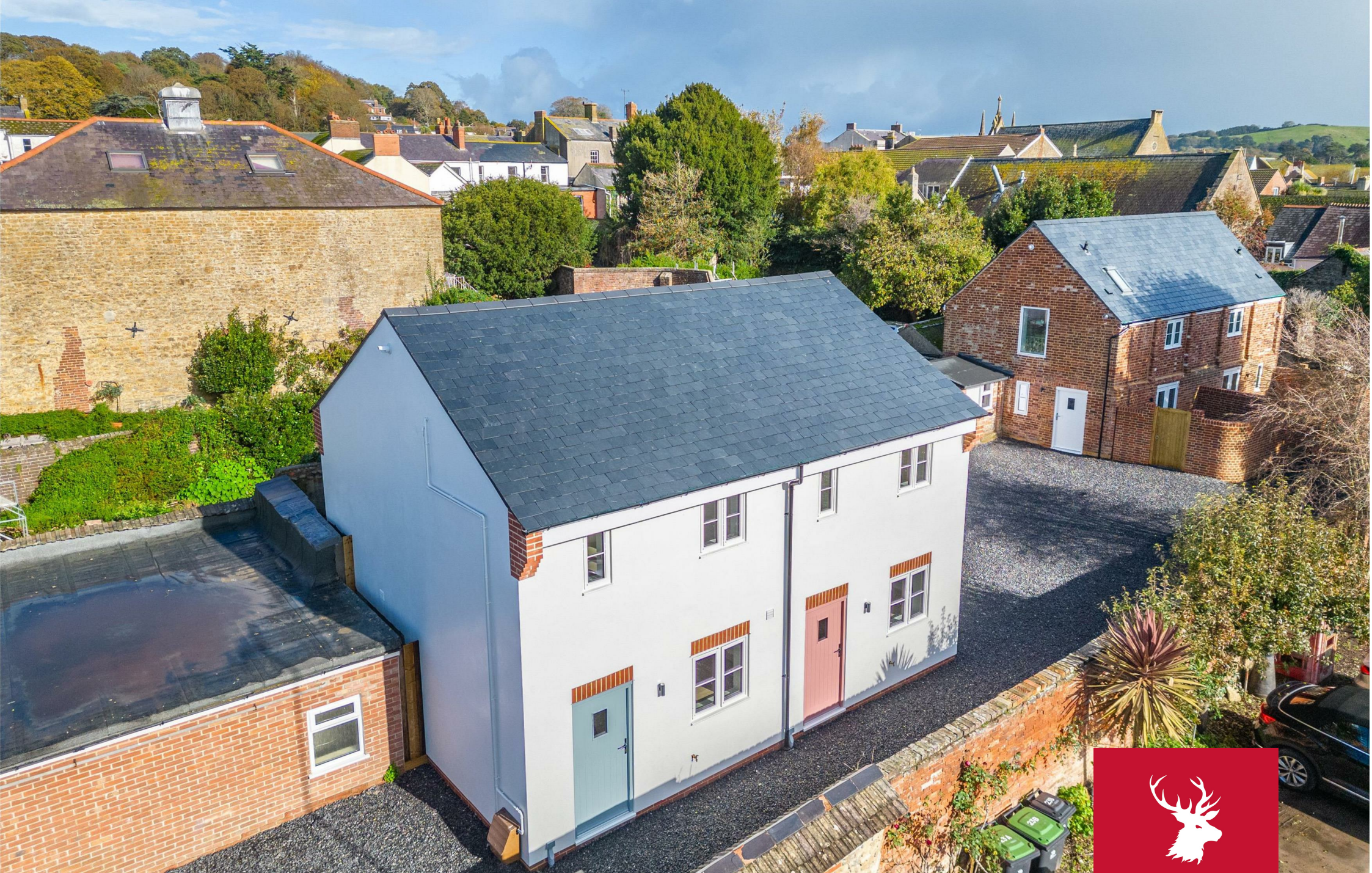
The Old Smokery