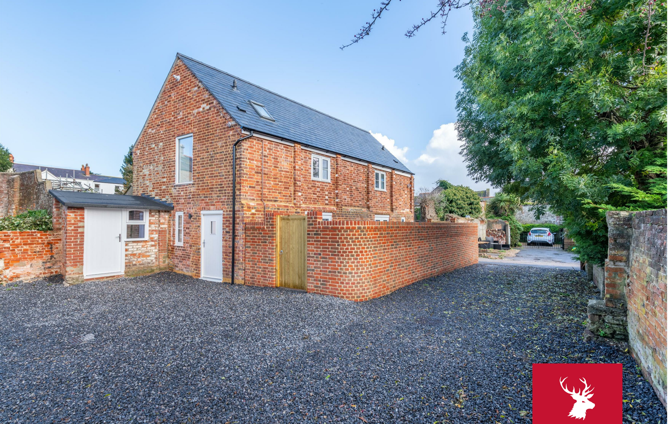
The Old Smokery