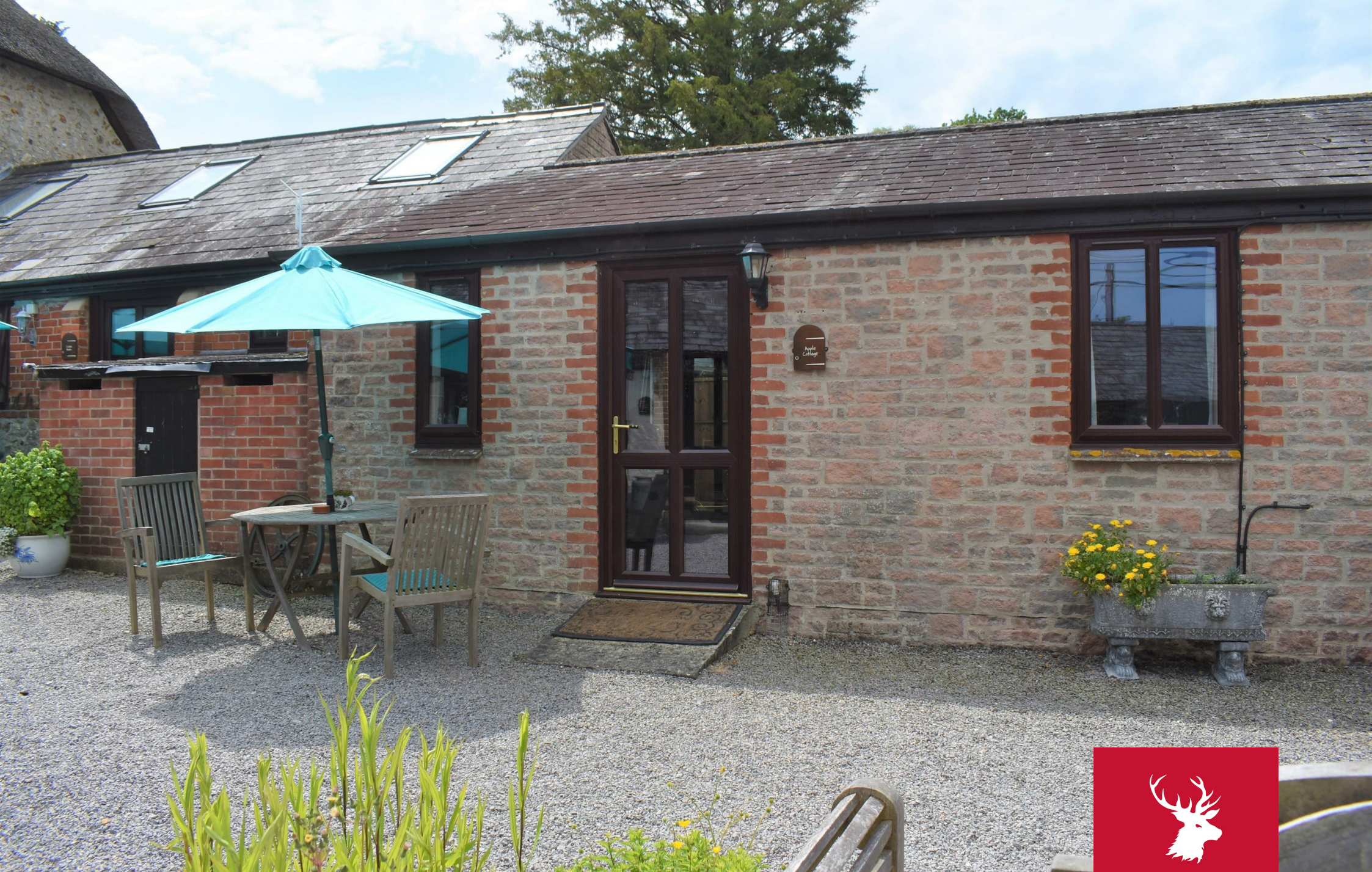
Apple Cottage, Berehayes Farm,