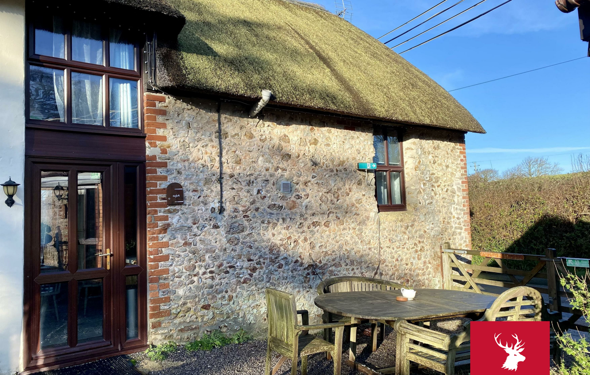
Hayloft, Berehayes Farm