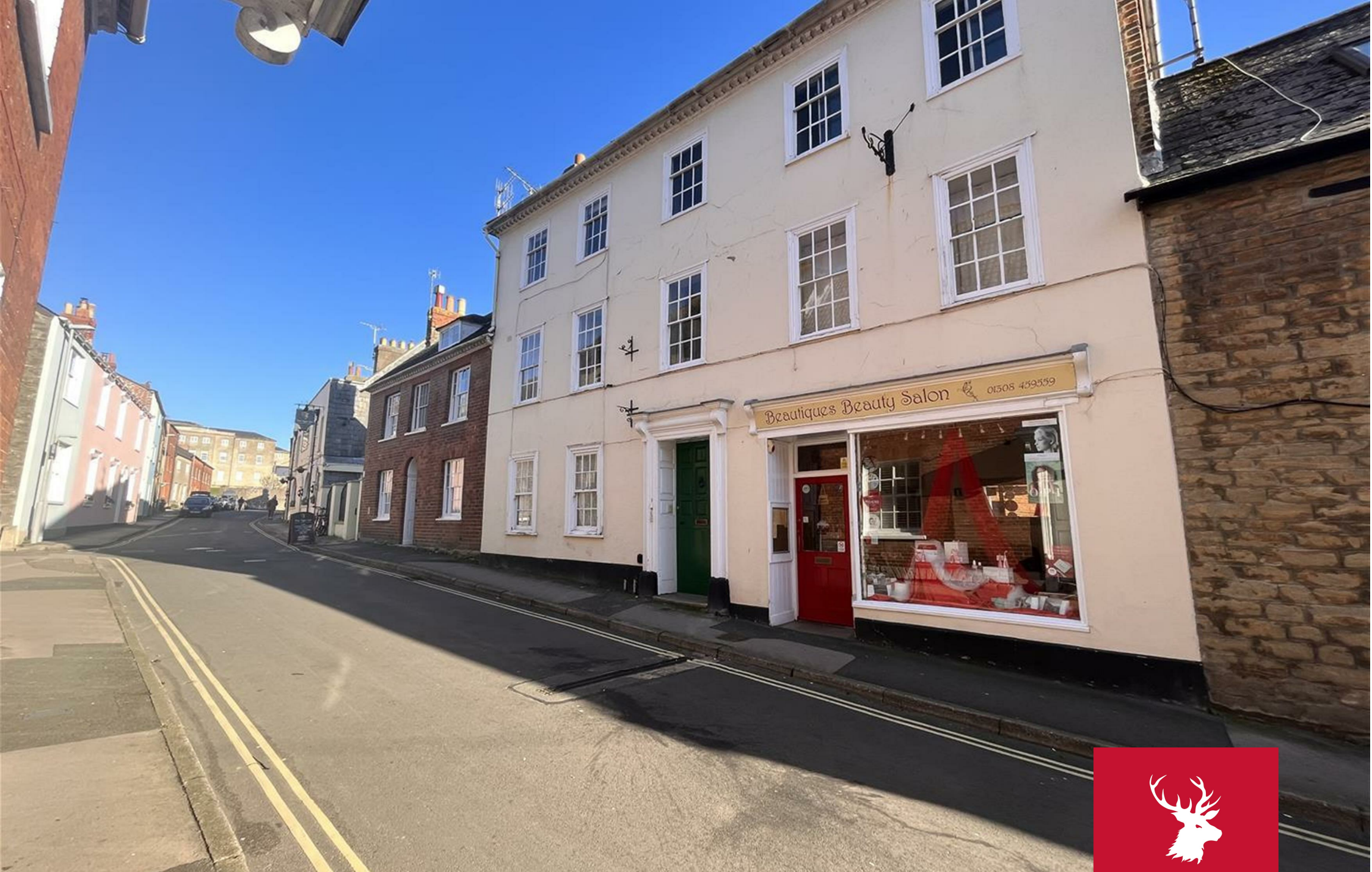
Flat 2, 8A Barrack Street