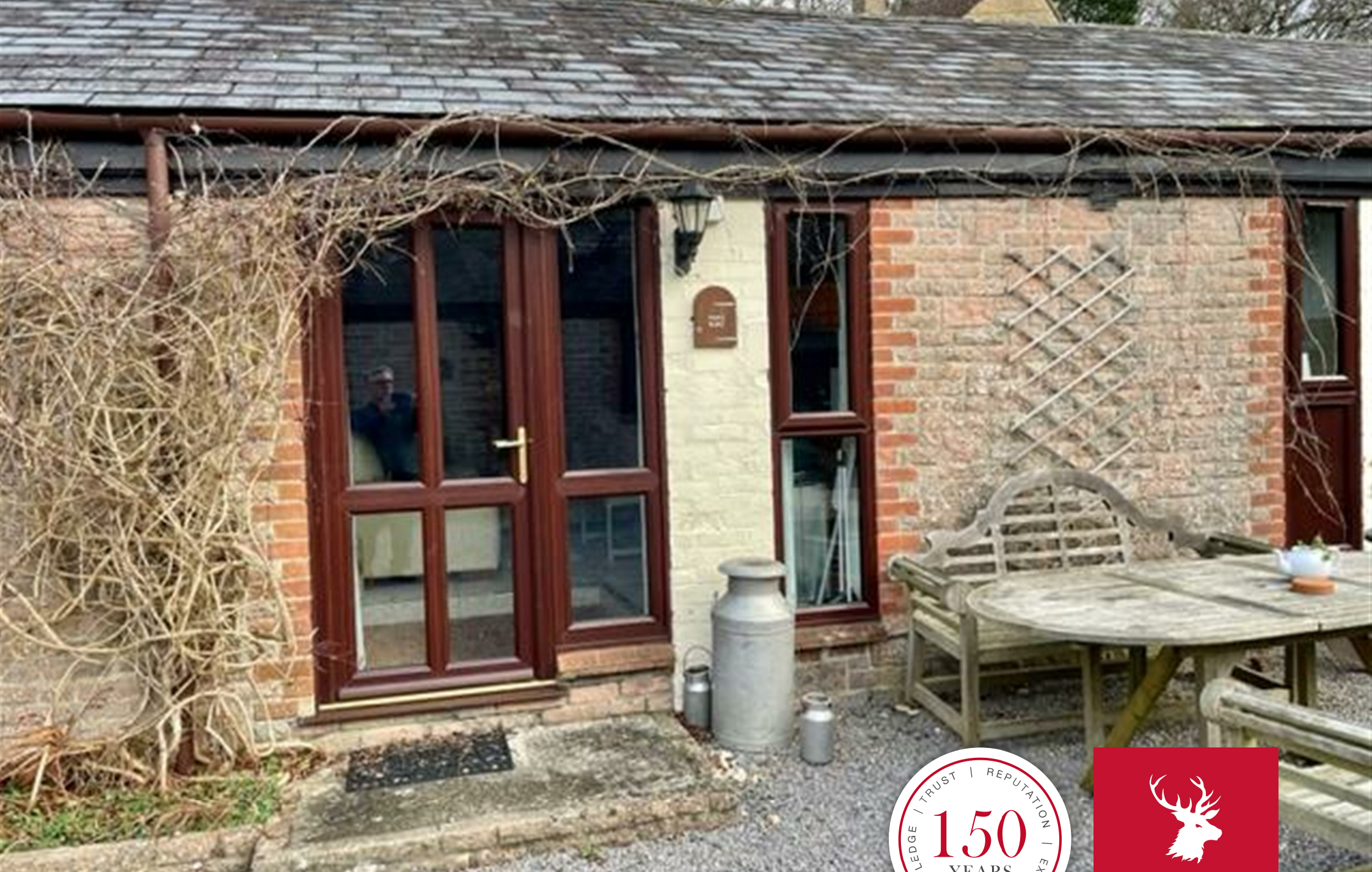
Dairy Barn, Berehayes Farm,