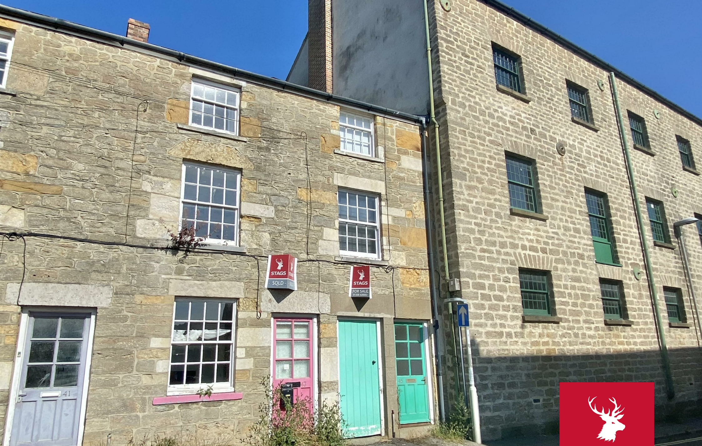
45 Rope Walks