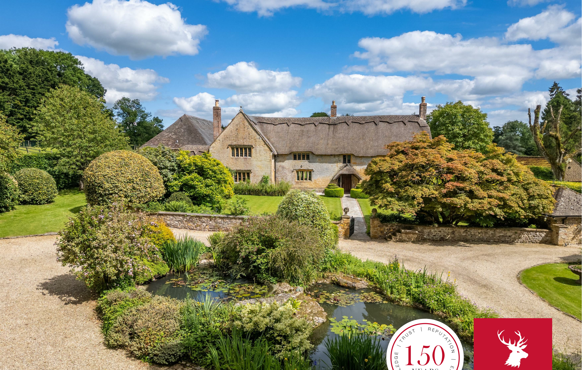
Old Sandpitts House,