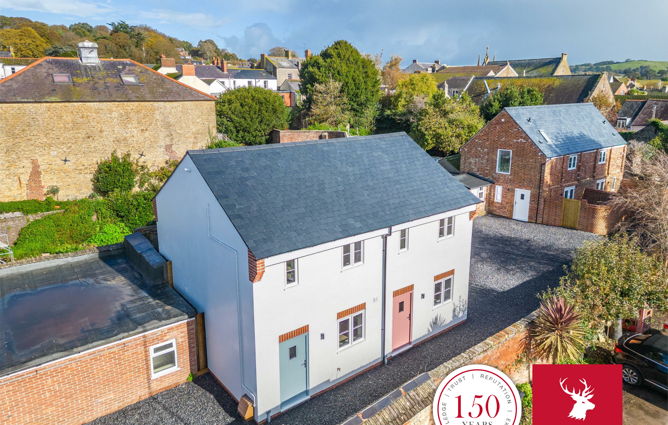
The Old Smokery,