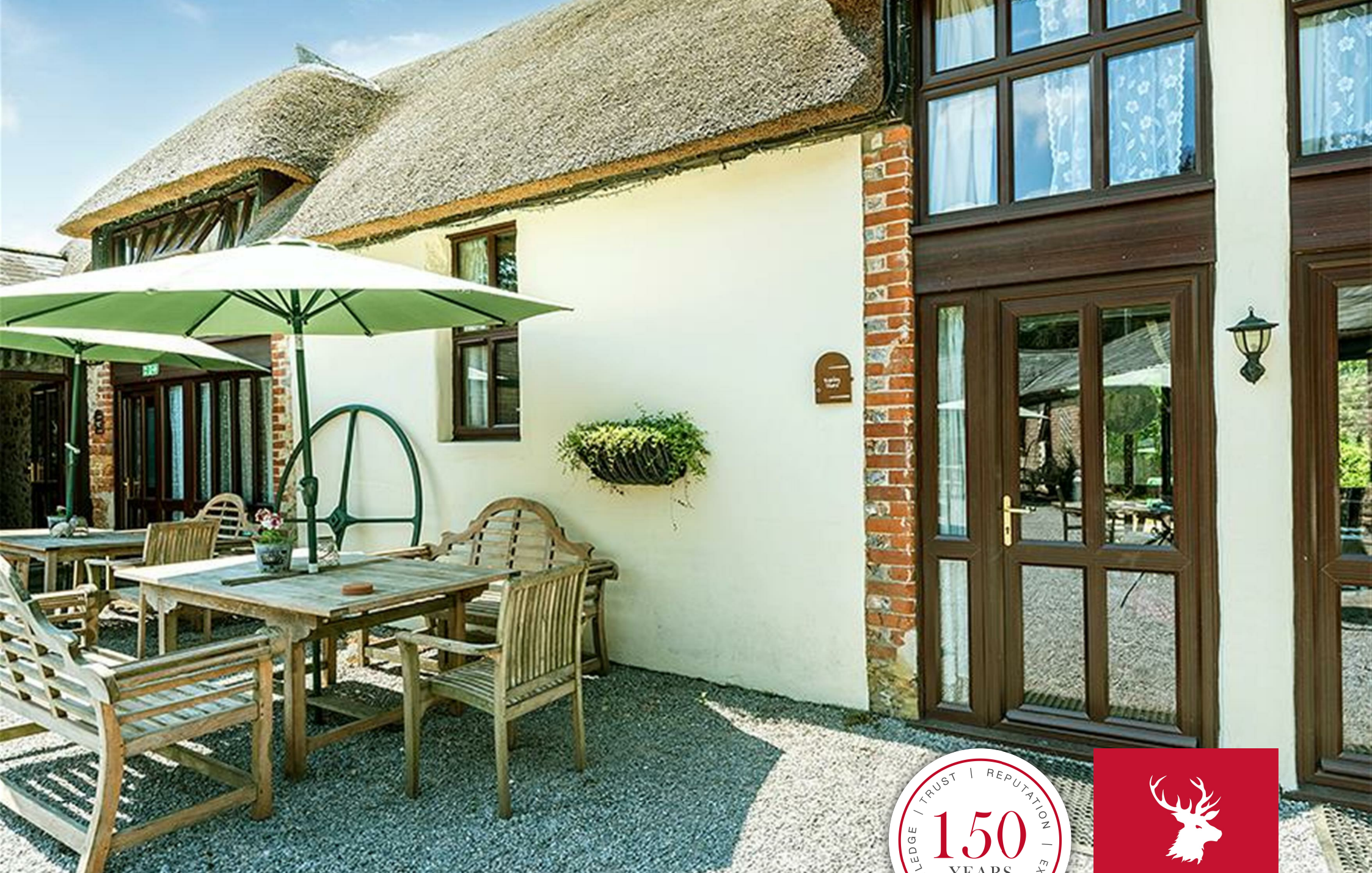
Barley Store, Berehayes Farm,