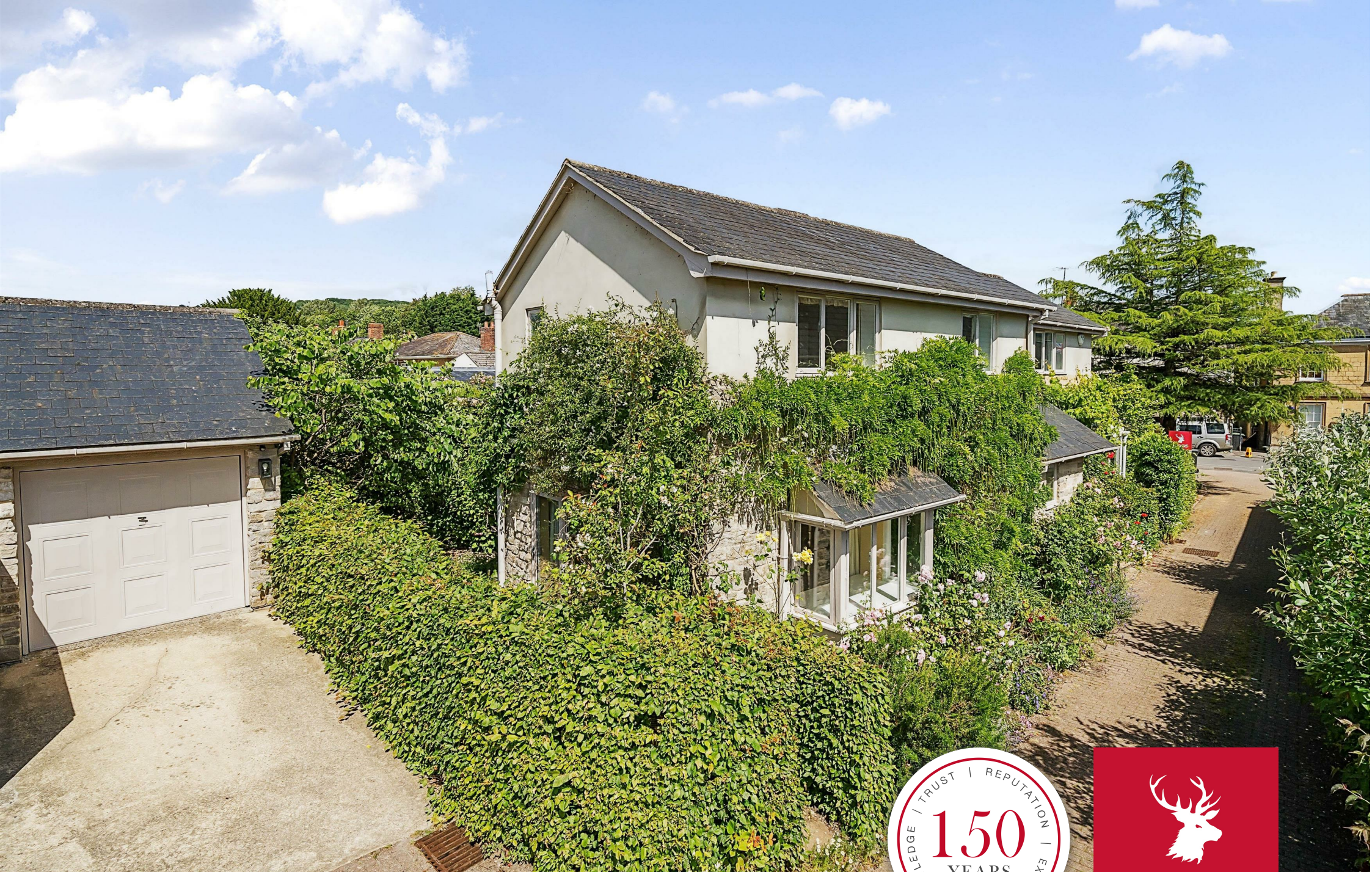
2 Pines Mews