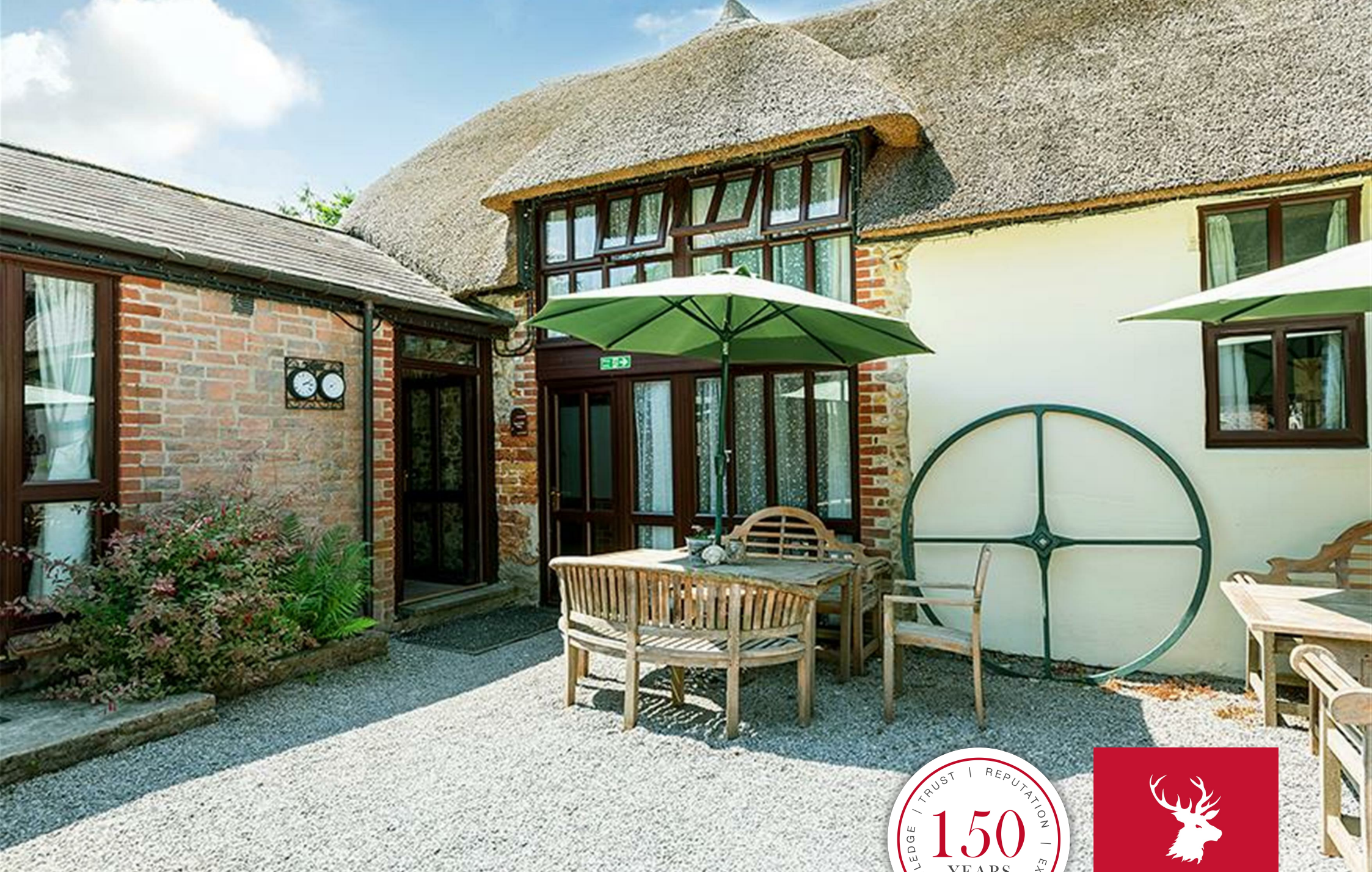
Squirrel's Drey, Berehayes Farm