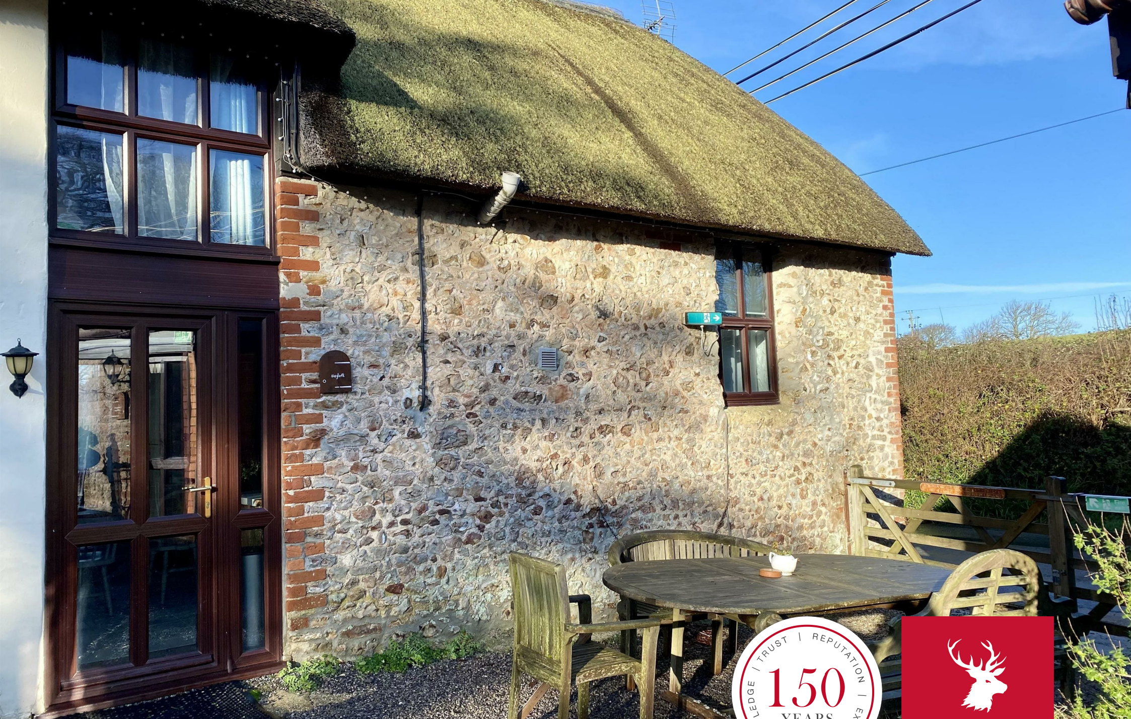
Hayloft, Berehayes Farm