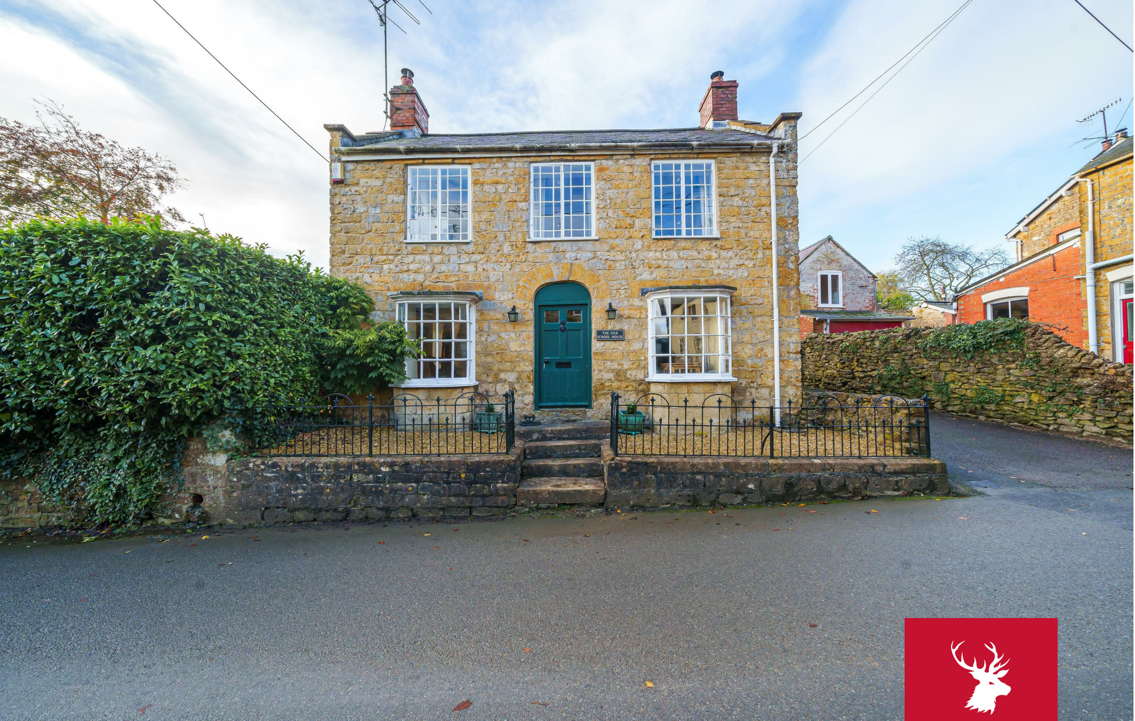
Old School House