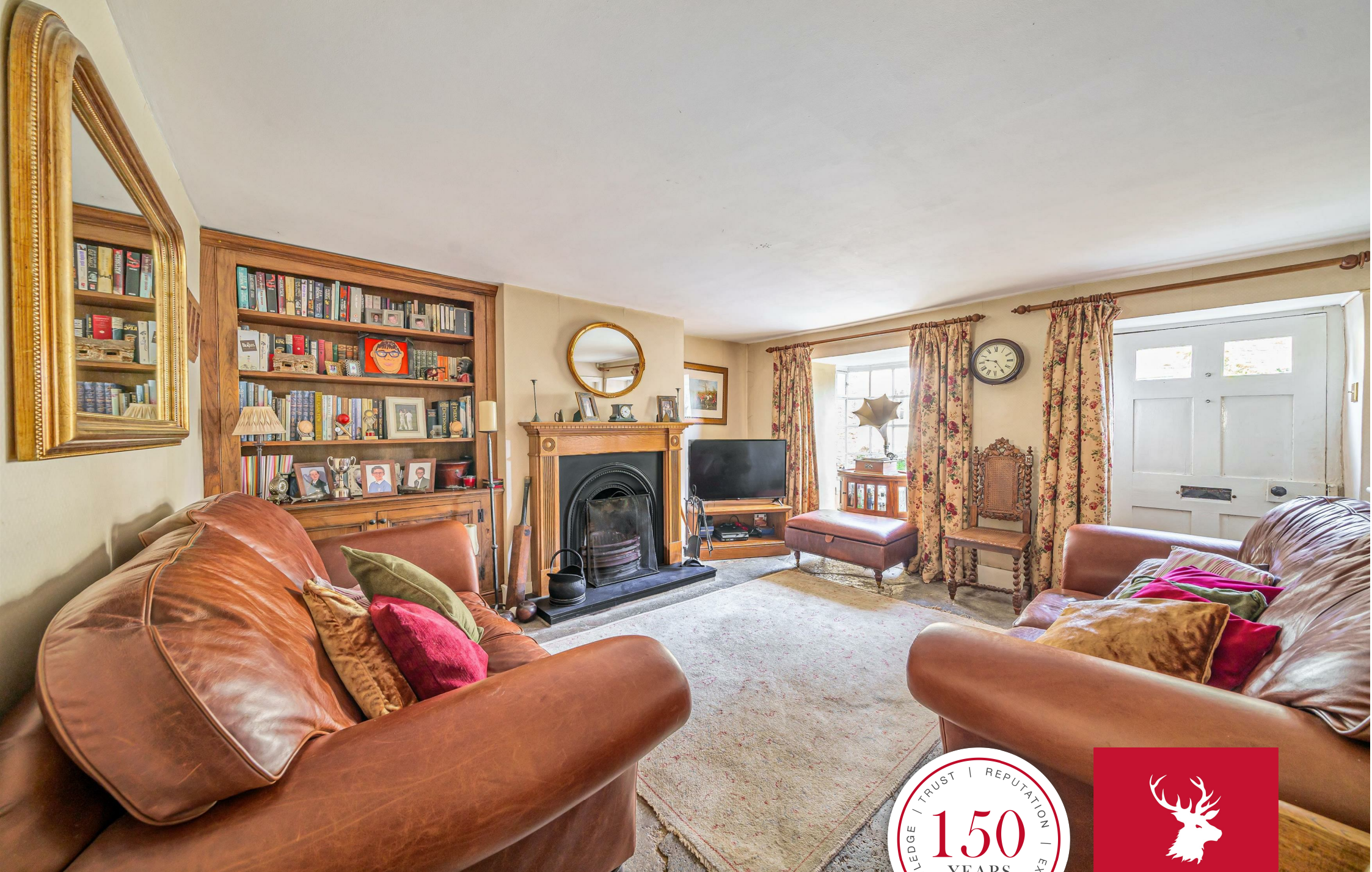
Old School House