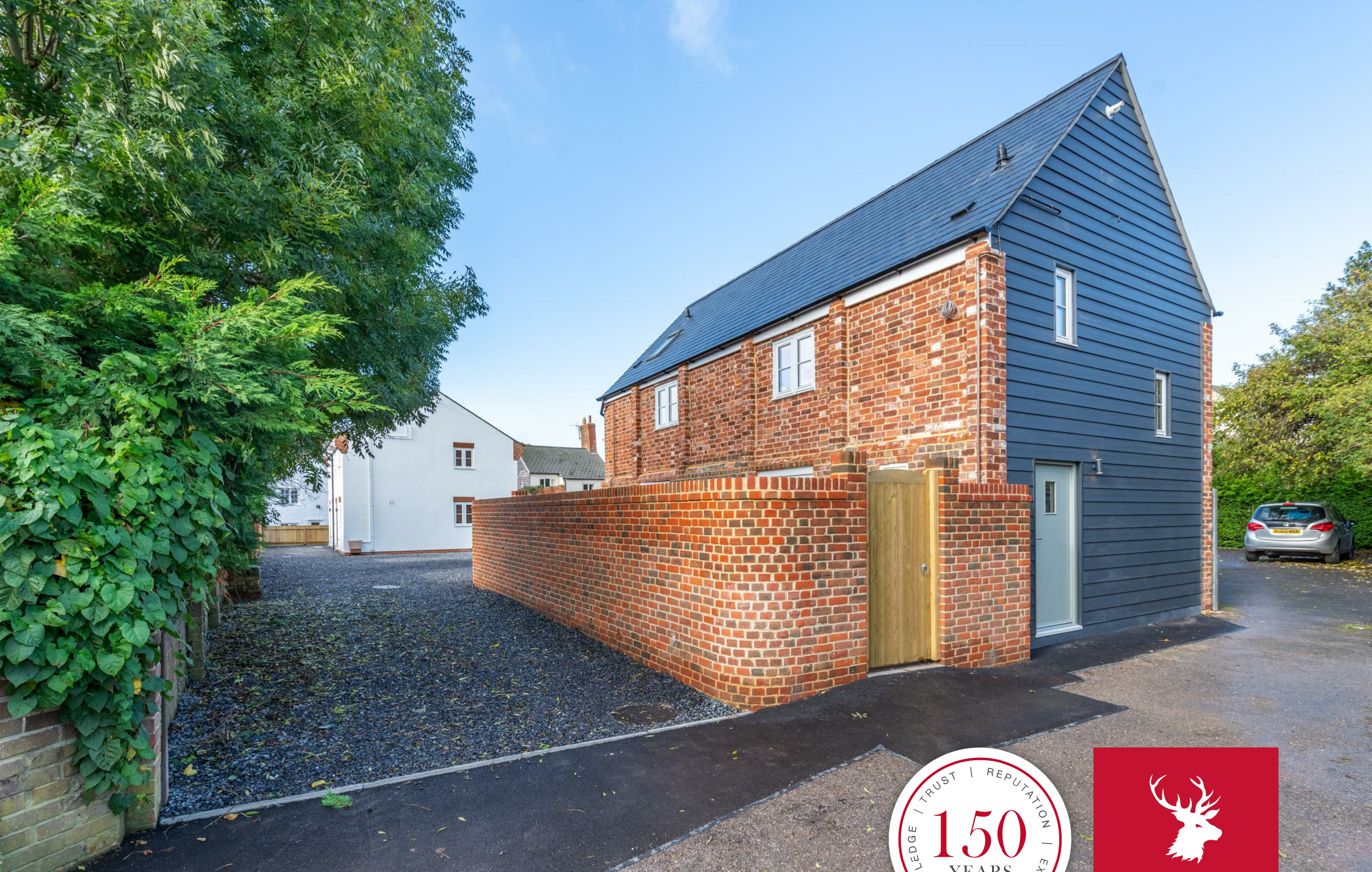
The Old Smokery,