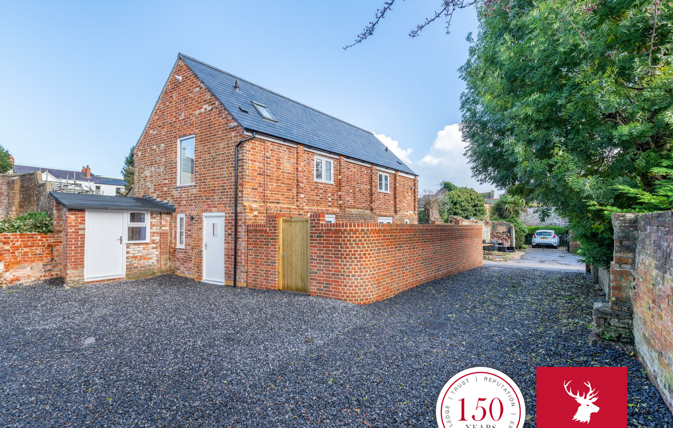
The Old Smokery