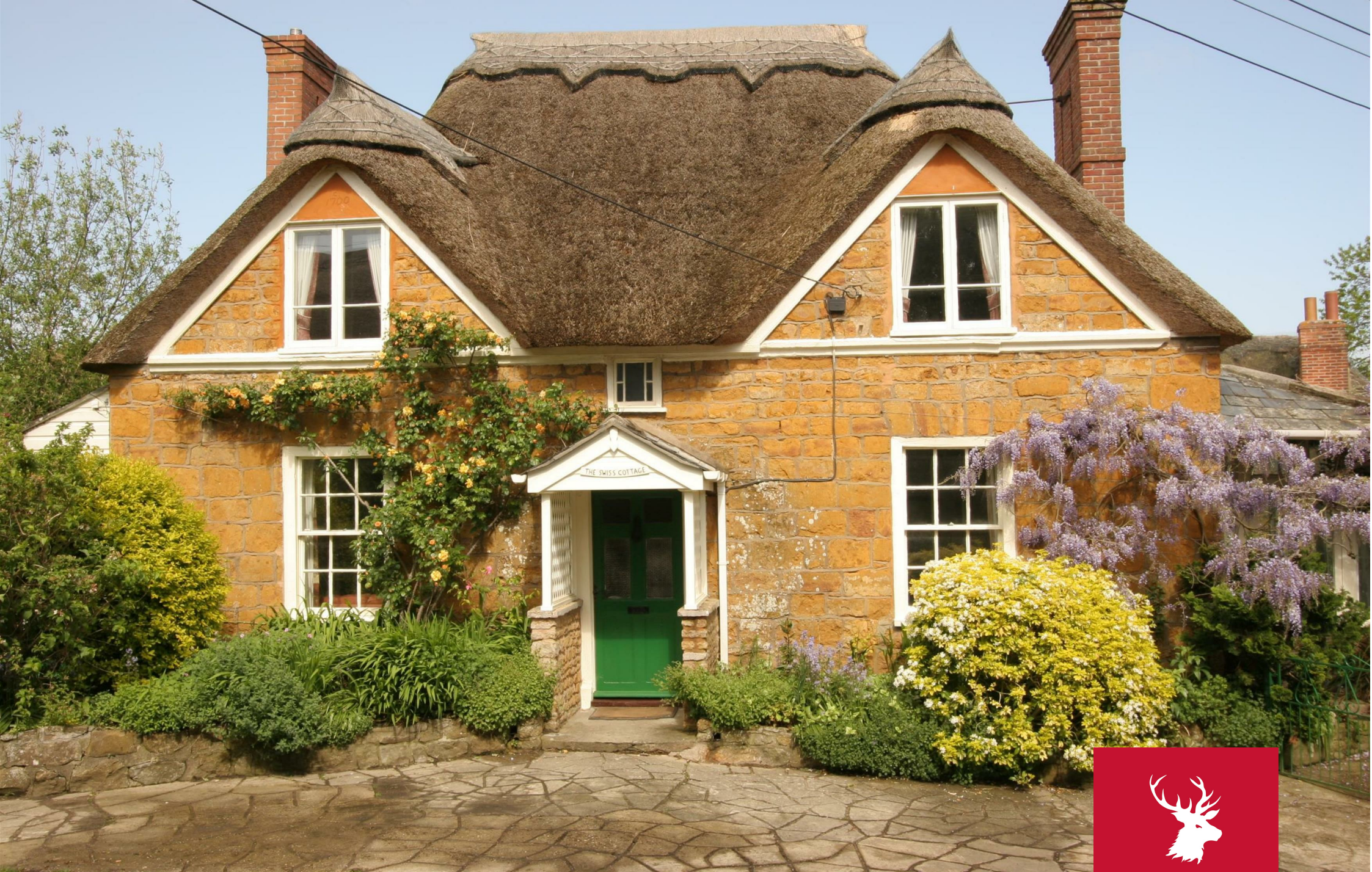
The Swiss Cottage