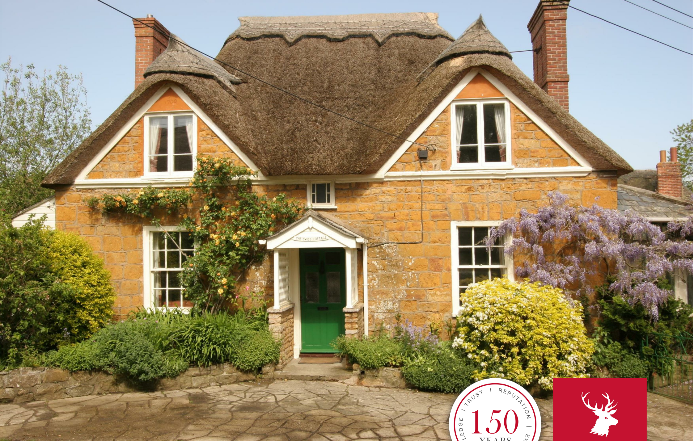
The Swiss Cottage