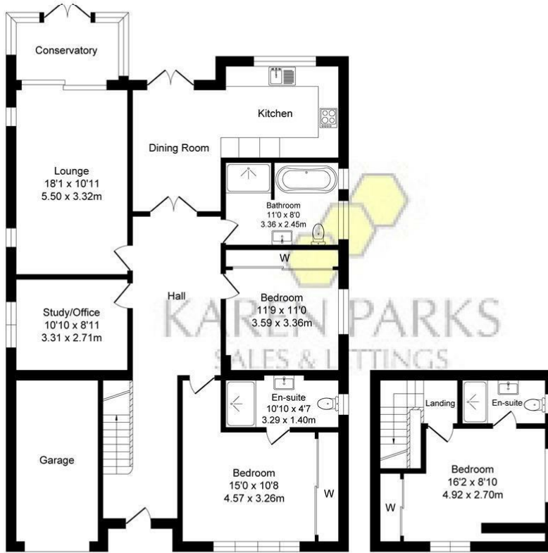
Ground Floor Approx. Floor Area 1466 Sq.Ft (136.2 Sq.M.)

Surveyed and drawn by Lens Media for illustrative purposes only. Not to scale. Whilst every attempt was made to ensure the accuracy of the floor plan, all measurements are approximate and no responsibility is taken for any error.