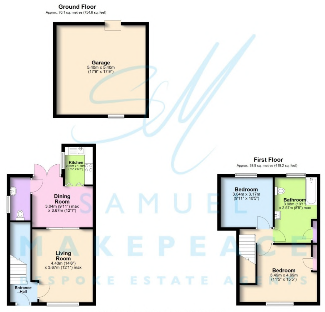
Total area: approx. 109.1 sq. metres (1174.0 sq. feet)