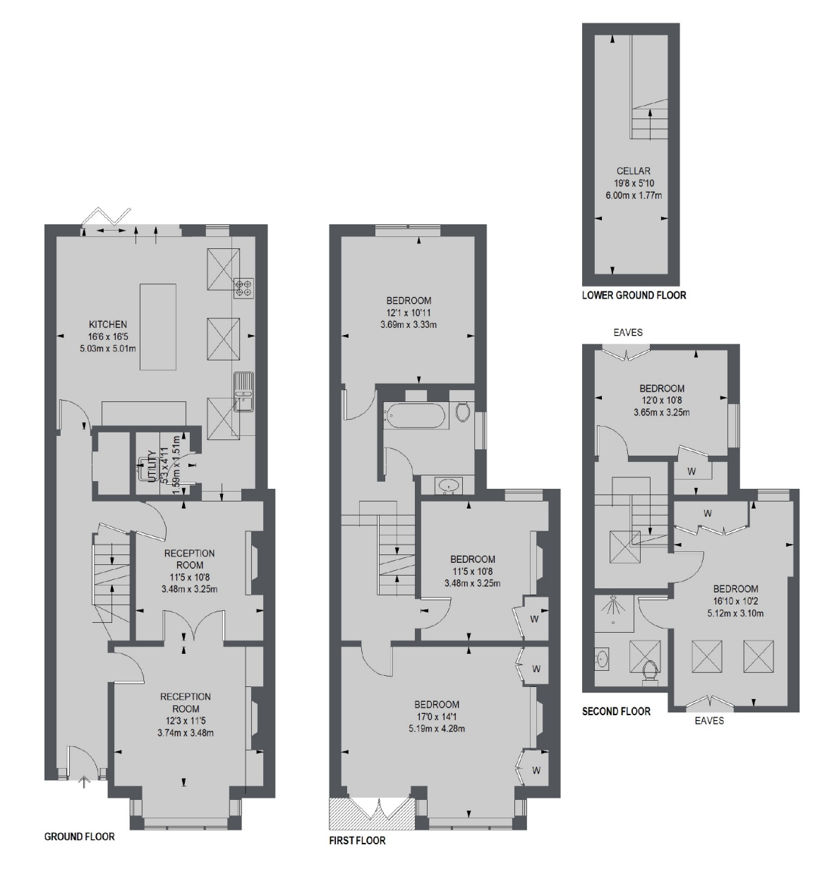
TOTAL APPROX. FLOOR AREA 1963 SQ. FT. (182.34 SQ. M.)

Jacksons Tooting 26 Tooting Bec Road London SW17 8BD 020 8767 0522 tooting.sales@jacksonsestateagents.com