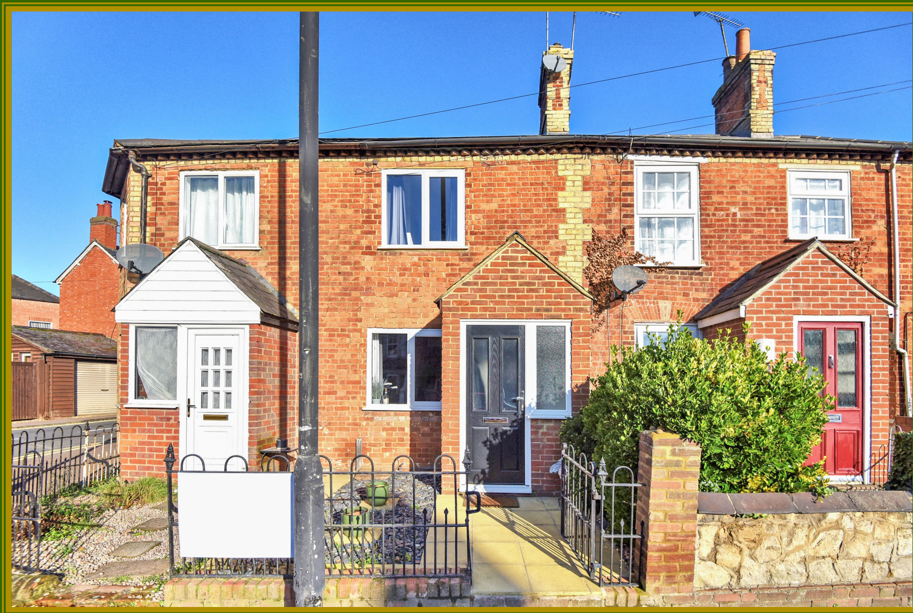
Rose Cottage, High Street, Waddesdon, Buckinghamshire, HP18 0JA

W. HUMPHRIES VILLAGE, COUNTRY AND EQUESTRIAN PROPERTY