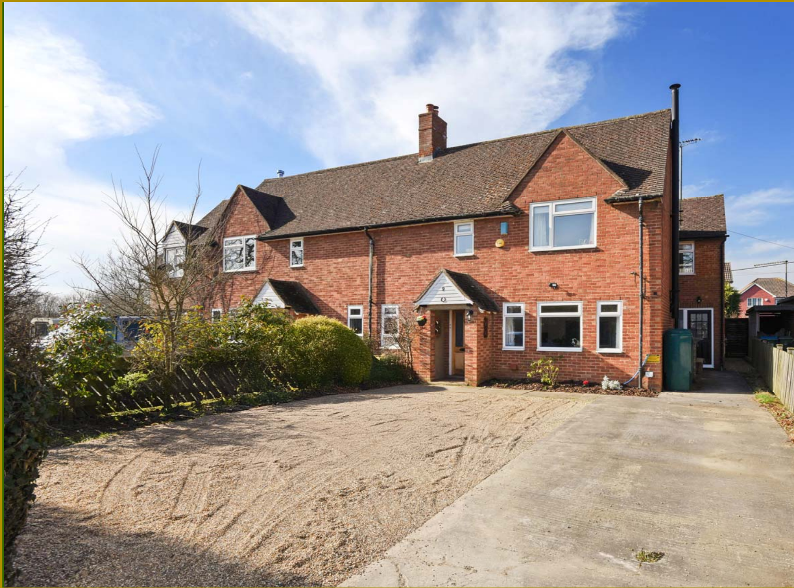
9 Rosamonds Cottages, Kingswood, Buckinghamshire, HP18 0RG

W. HUMPHRIES VILLAGE, COUNTRY AND EQUESTRIAN PROPERTY