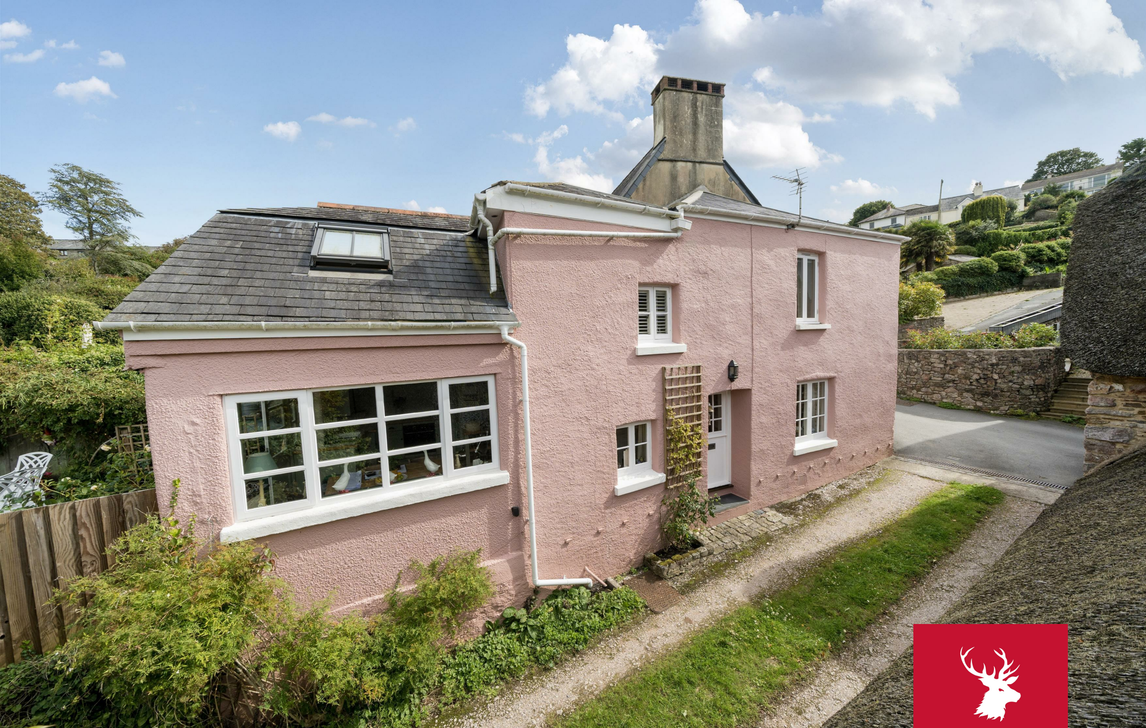
River Creek Cottage