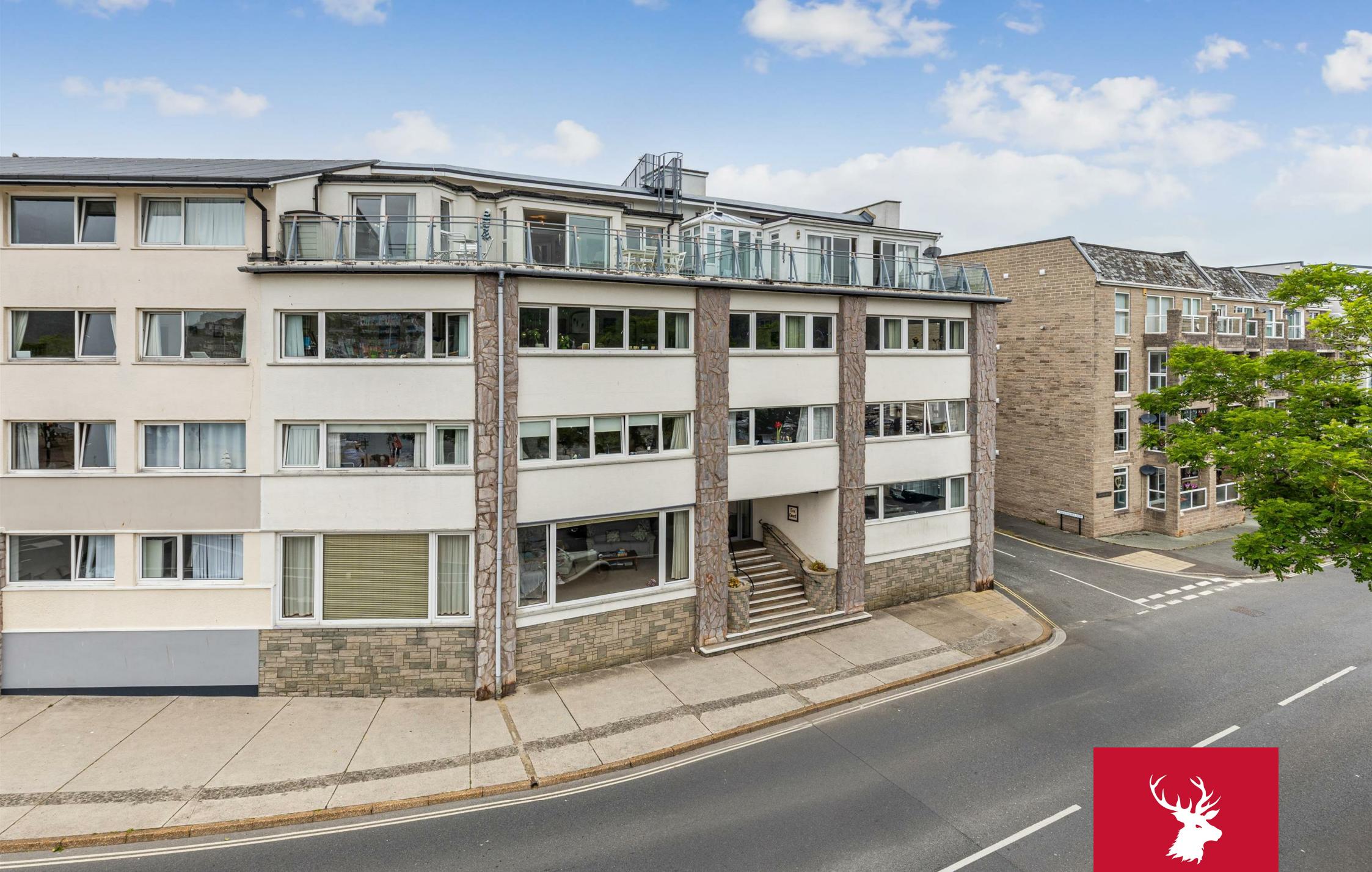
7 Lee Court