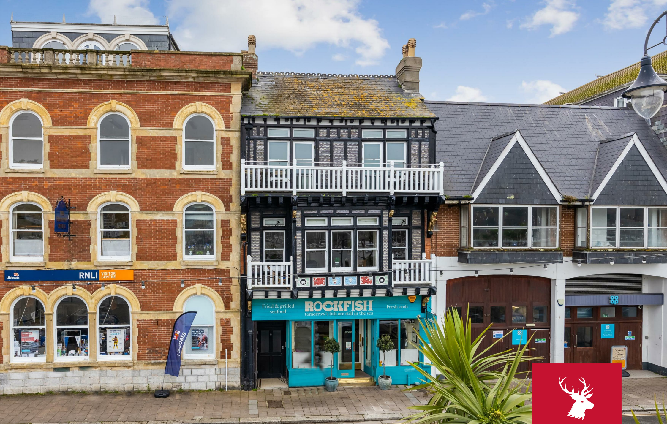
2 Embankment House