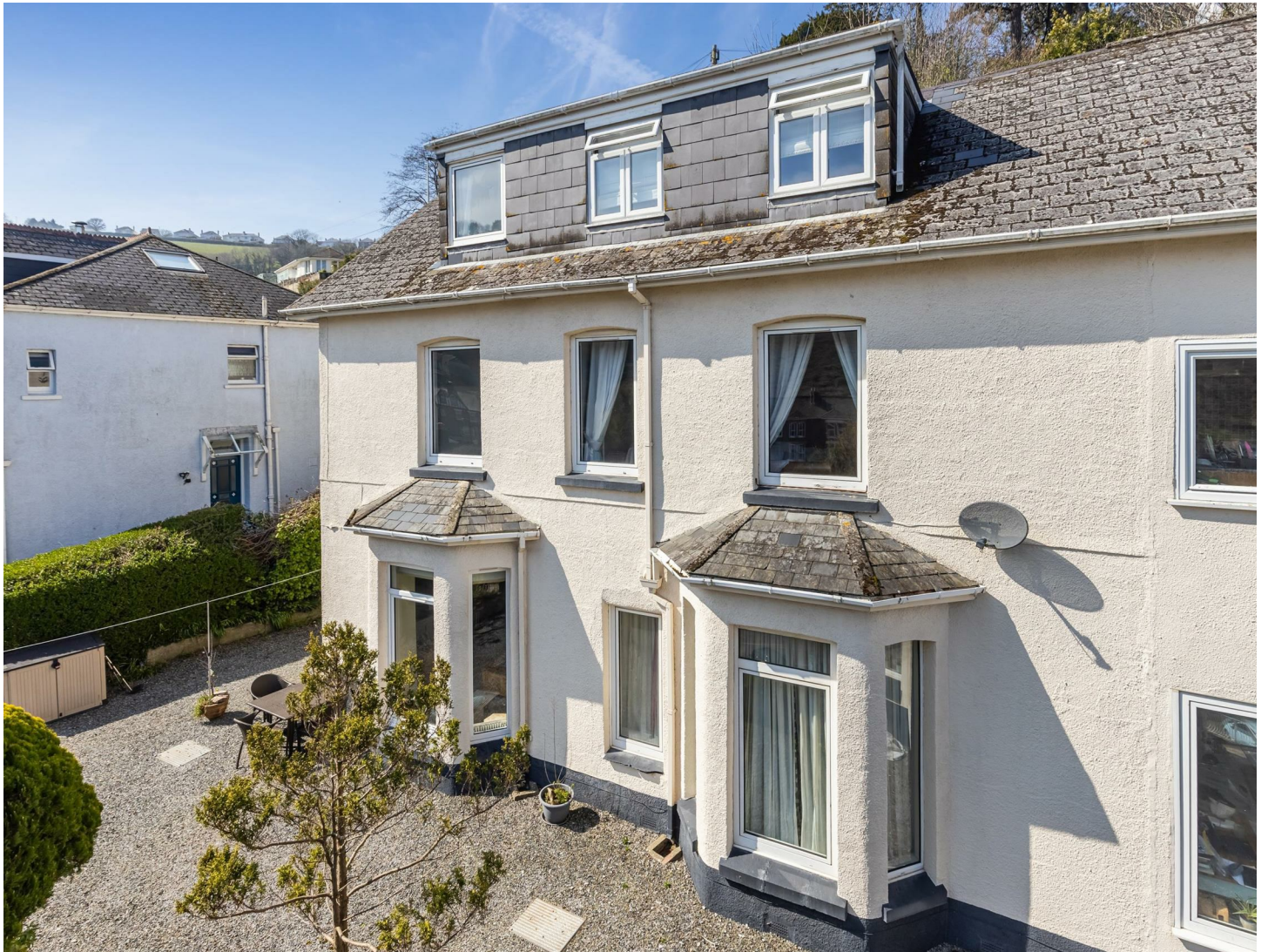
Flat 1 Hillside Court