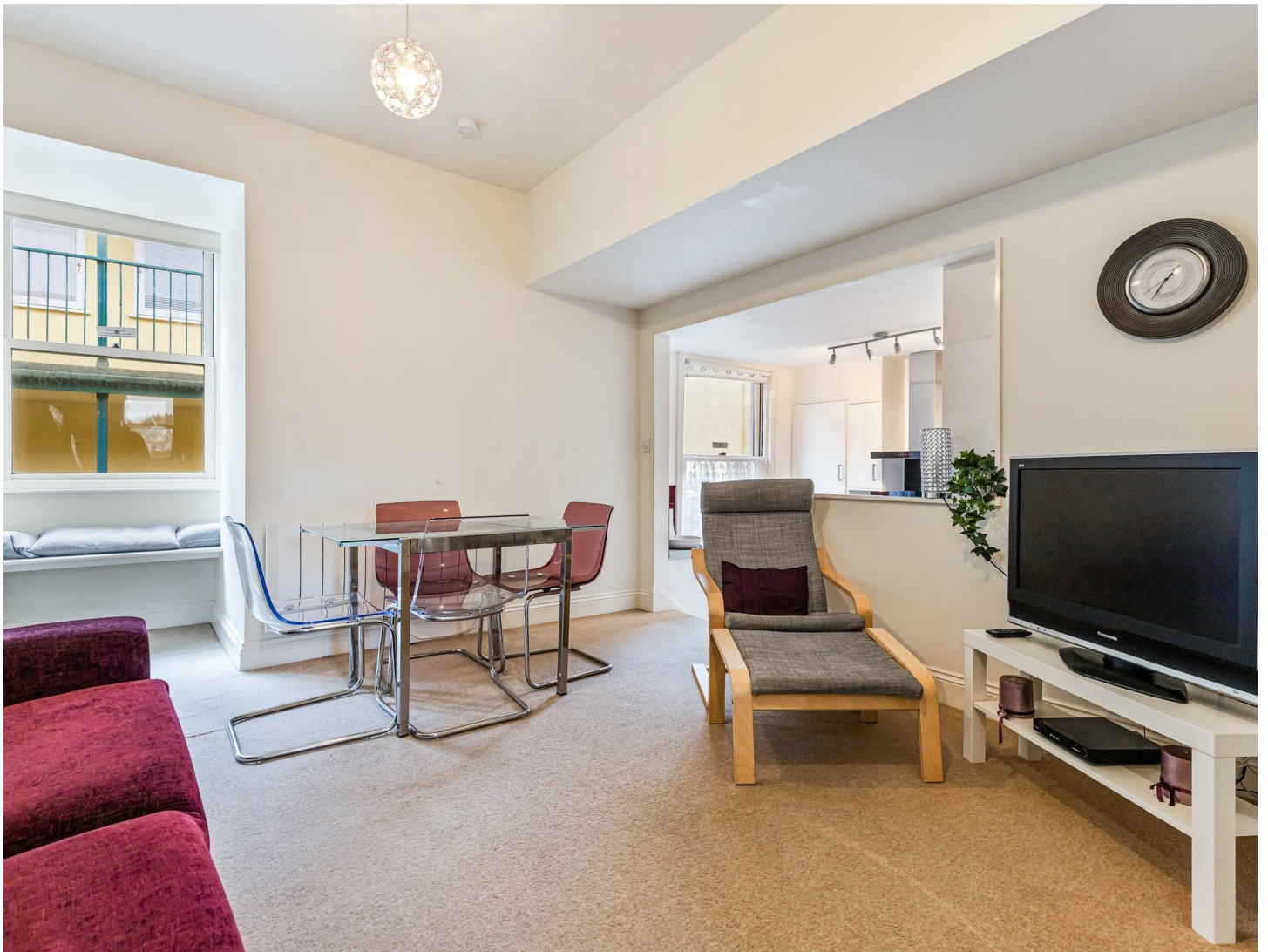
Flat 6 Raleigh Apartments