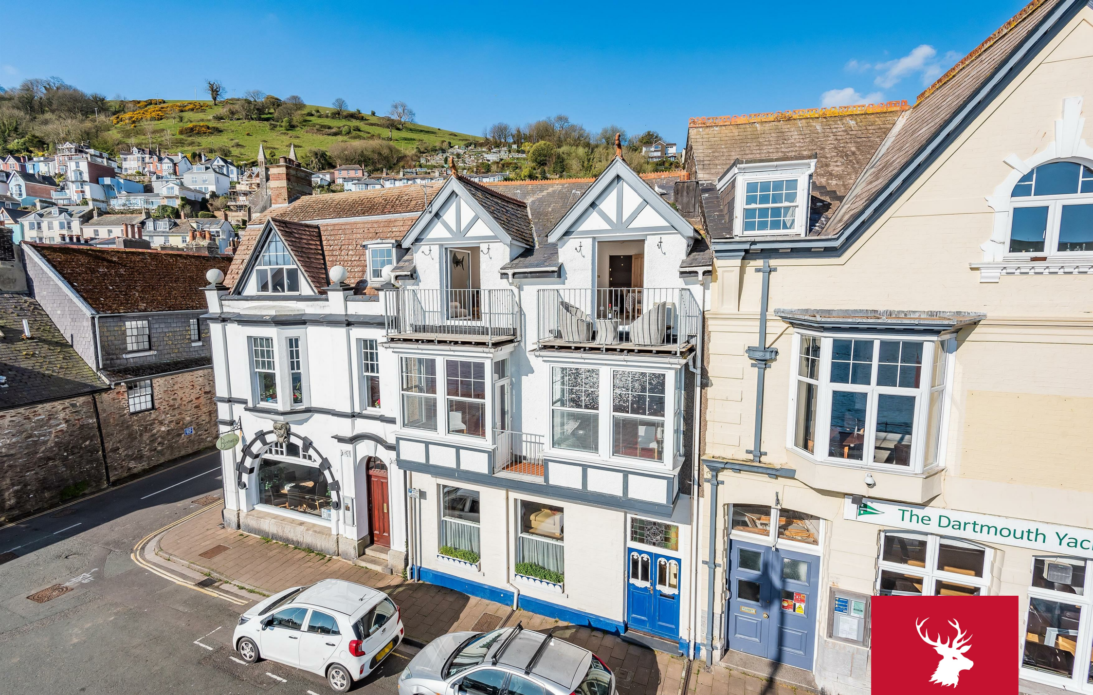
Flat 3 Clifton House,