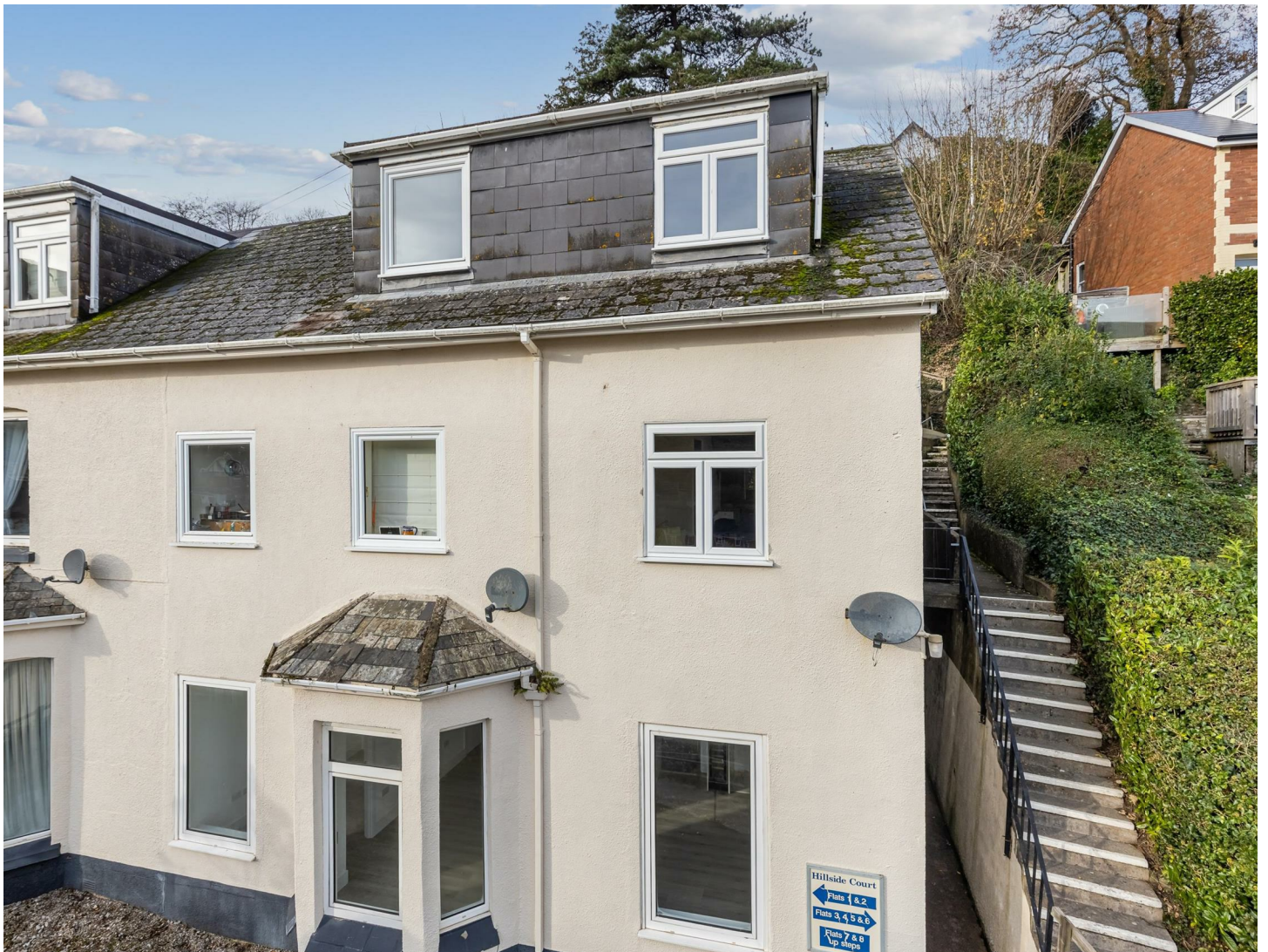
Flat 7 Hillside Court