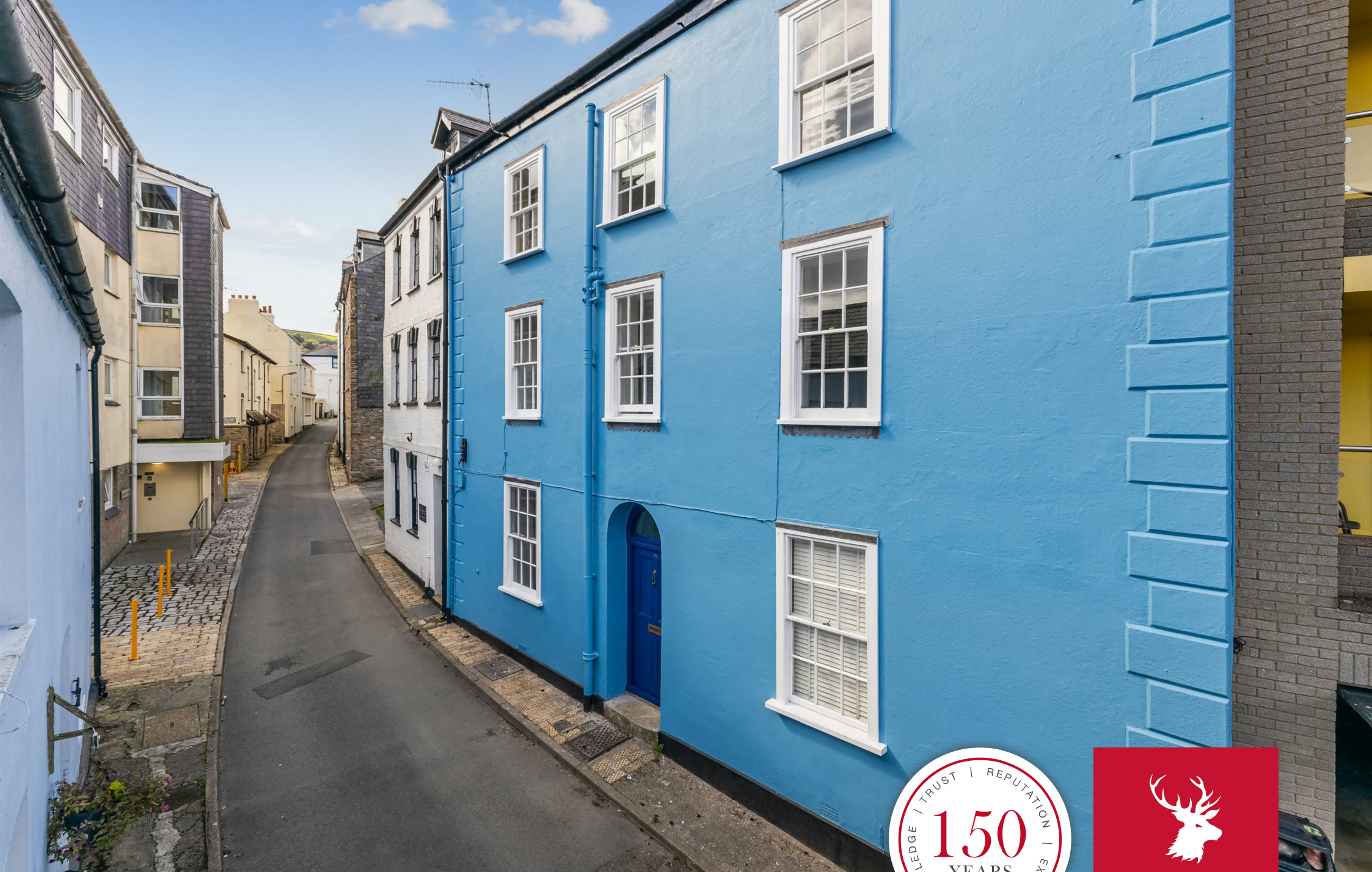
16a, Clarence Street