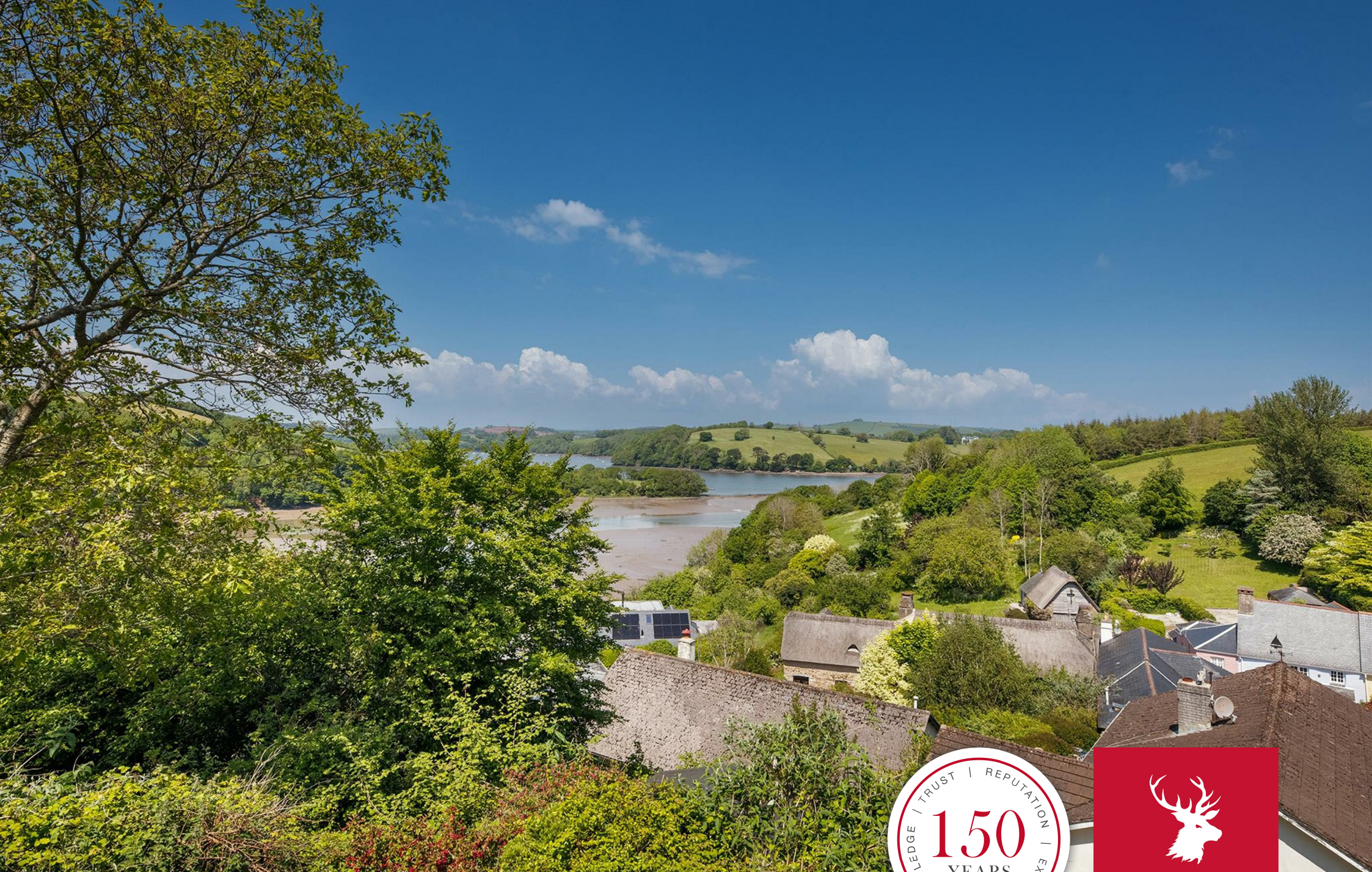
4 Dart View