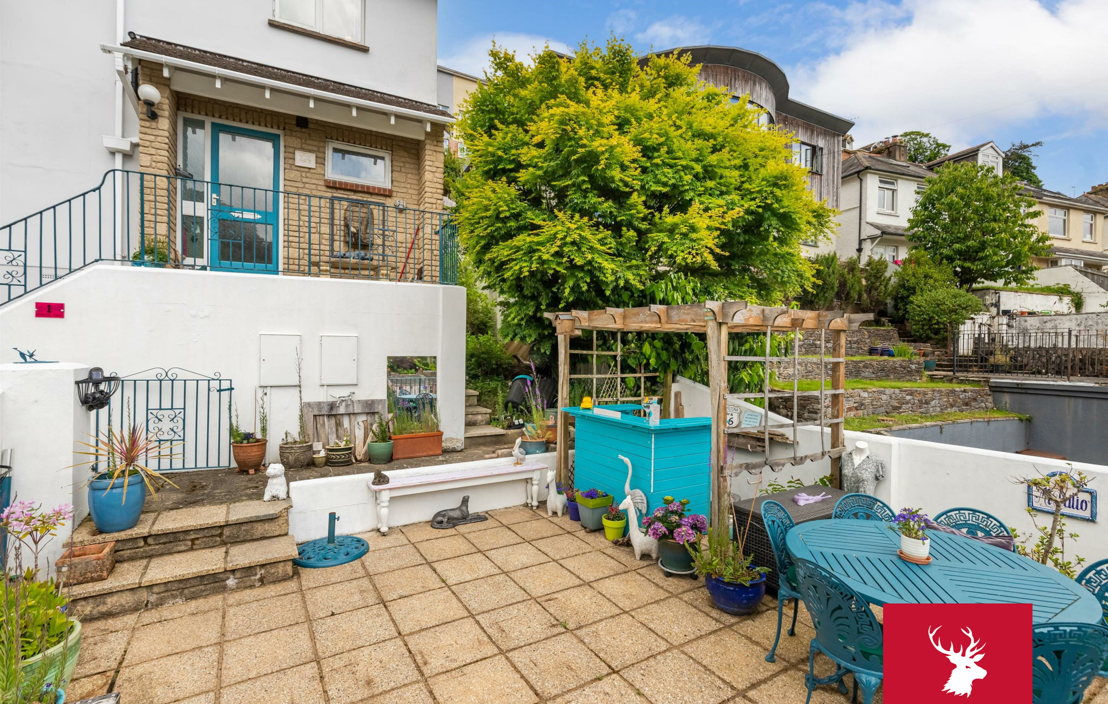
1 Hillside View