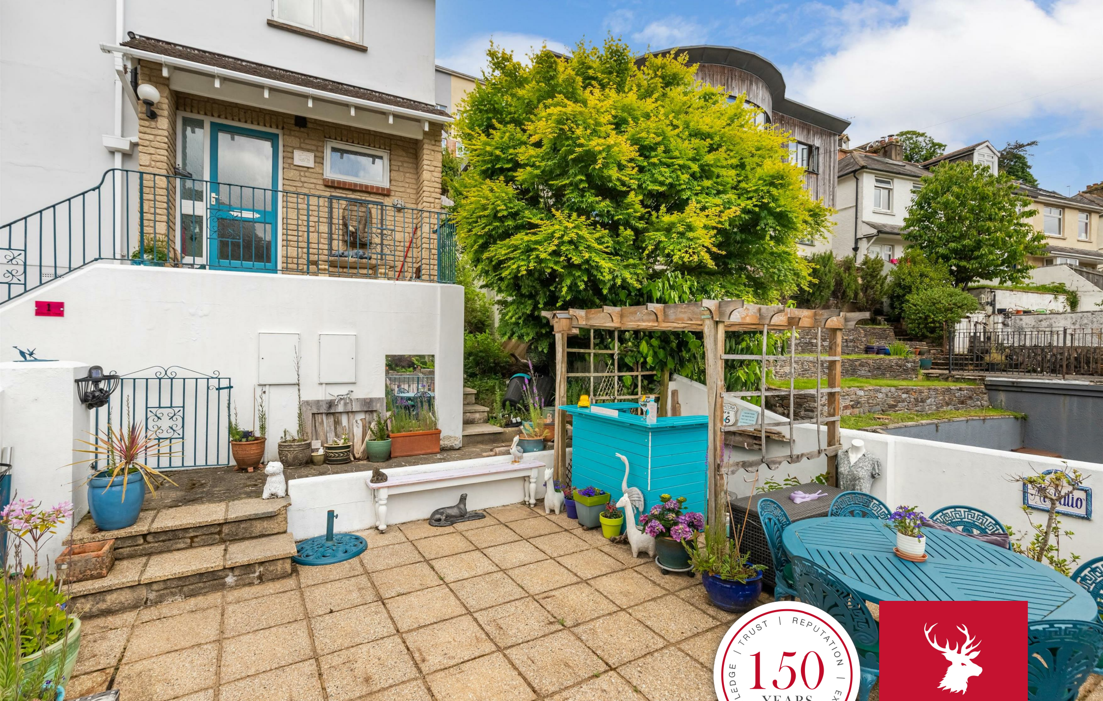
1 Hillside View